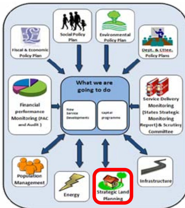
The Strategic Land Use Plan within the States Strategic Plan

What the Plan Review must achieve: The Island Development Plan must make provision for new office development within the main centres, including land at Admiral Park, that will help to deliver wider economic, social and environmental benefits. Refurbishment of existing office sites should be encouraged to make efficient use of land.