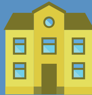
College of Further Education

Both organisations would be mandated to strengthen collaboration, including within a new Education Law