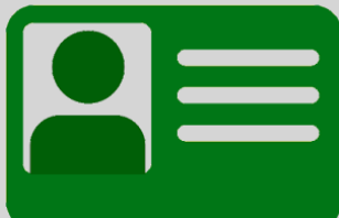
Photo I.D (e.g. Passport, Driving License, Citizen Card)