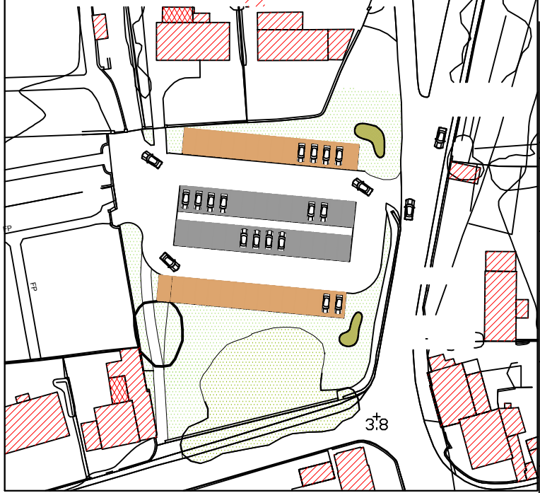
Proposed block layout plan