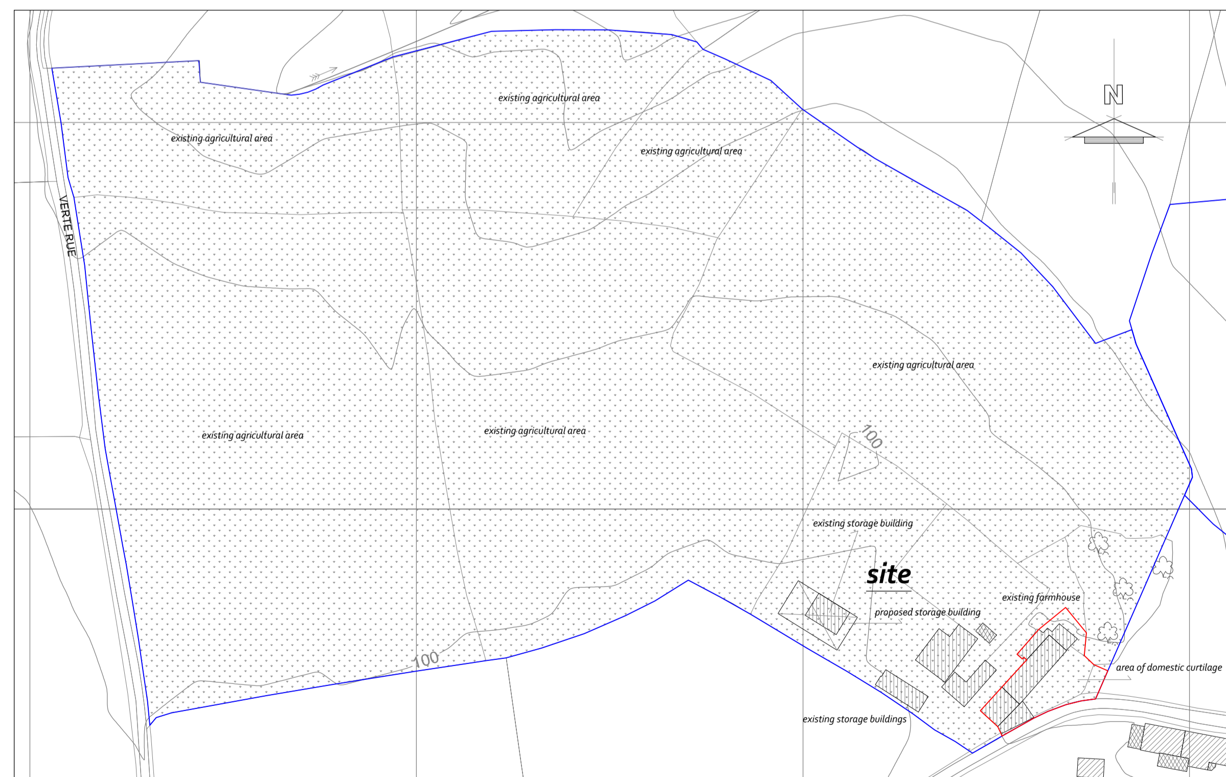
block plan approximate scale 1 : 1000 @ A1, for identification purposes only. DO NOT SCALE OFF THIS PLAN

this line is 100 mm long at the original drawing size of A1