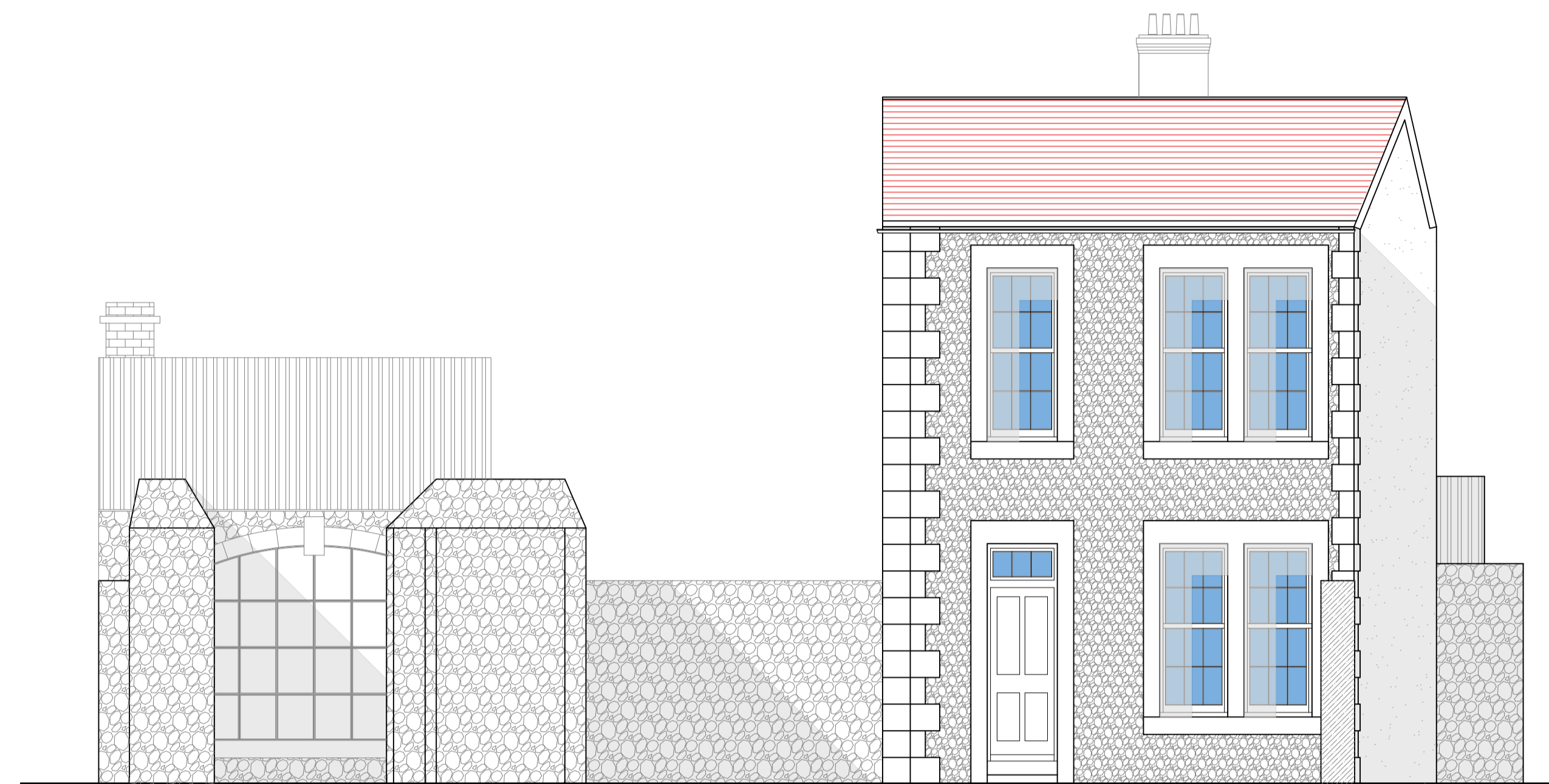
Existing Roadside Elevation