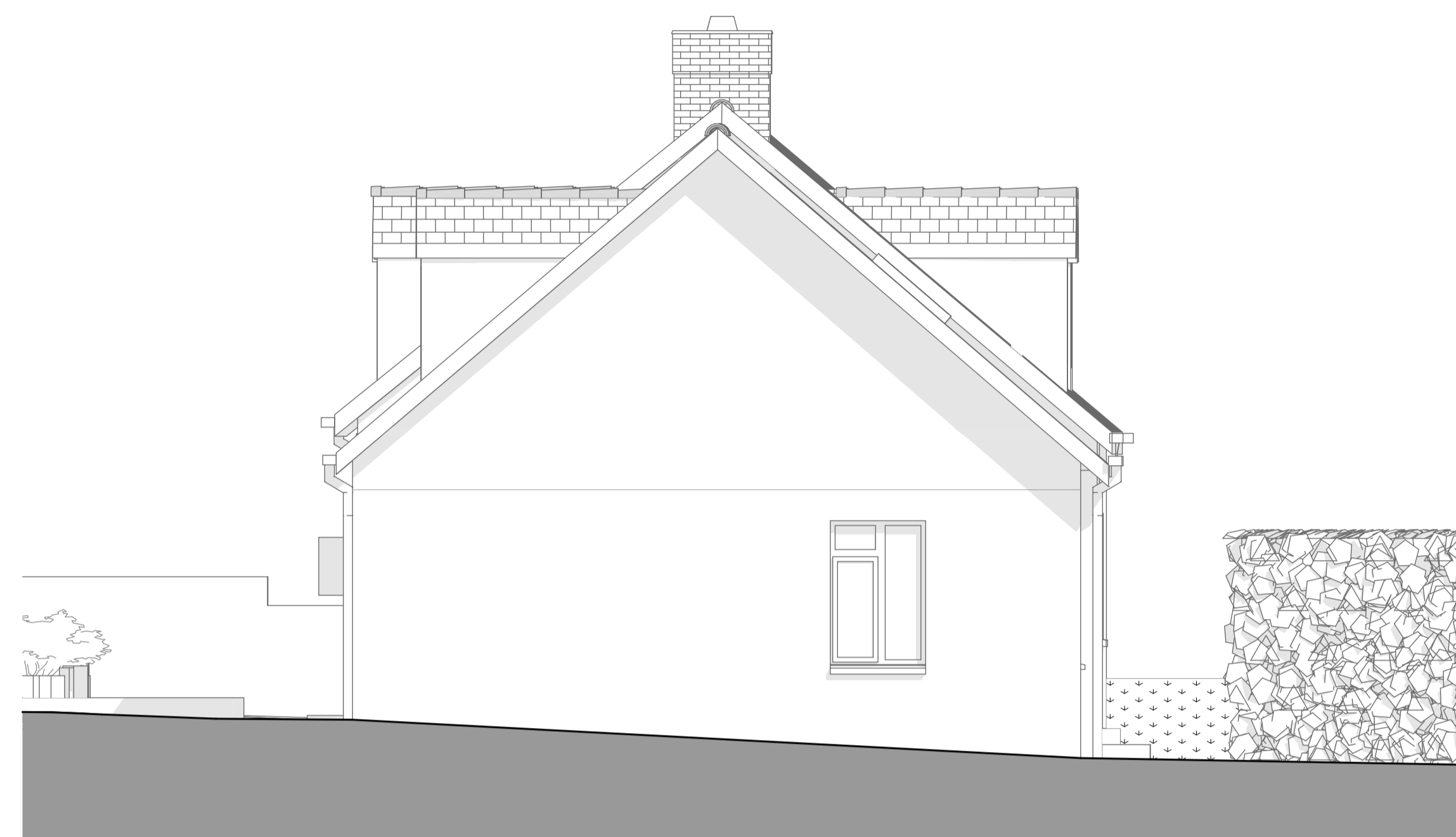
E-11 Elevation 1:50