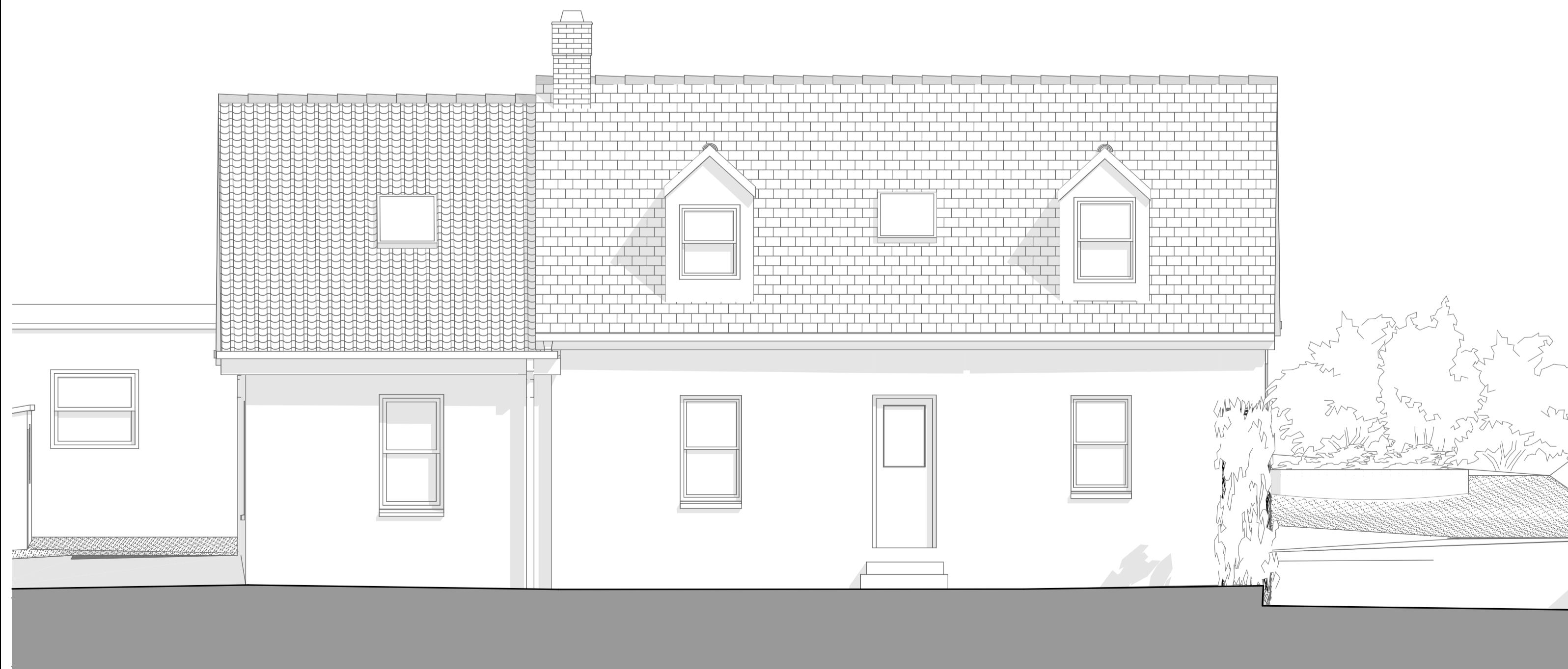
E-12 Elevation 1:50