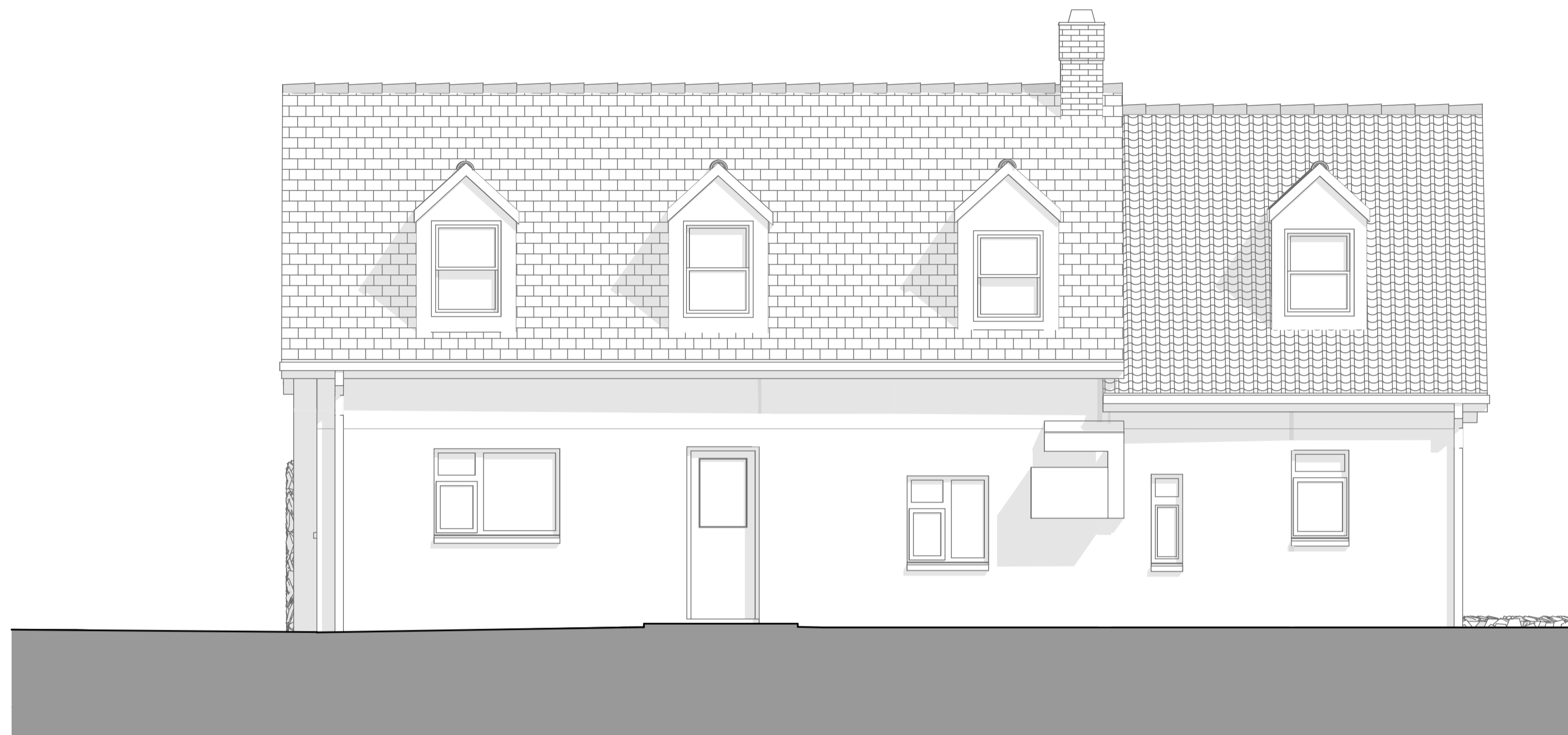
E-09 Elevation 1:50