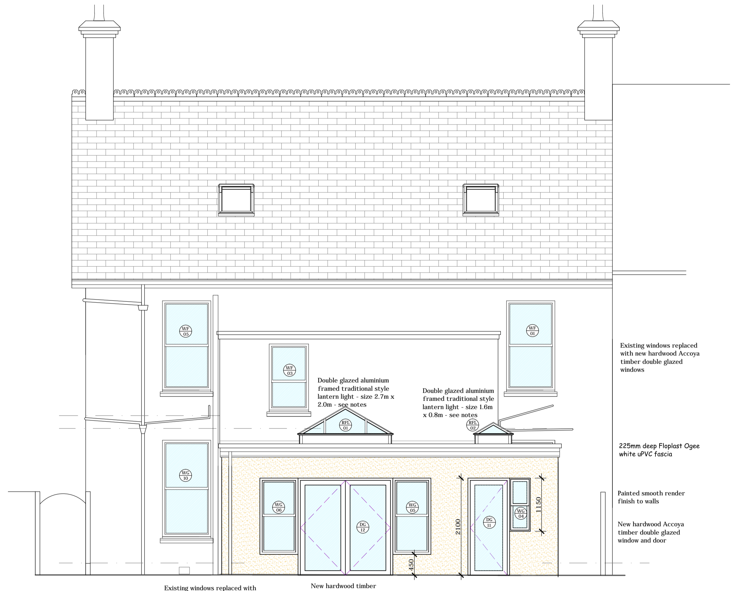
East Elevation. Scale - 1:50.