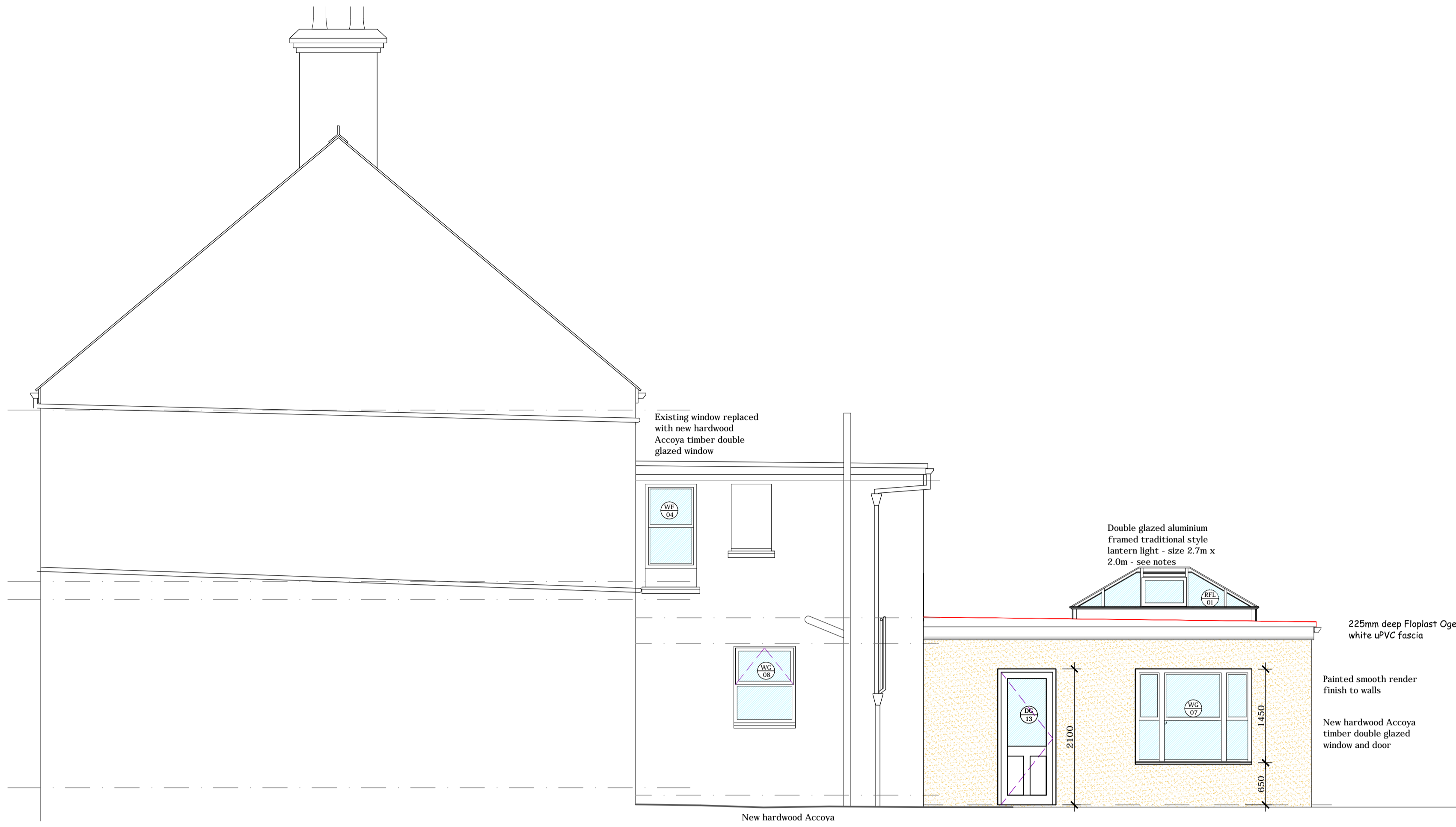
South Elevation. Scale - 1:50.