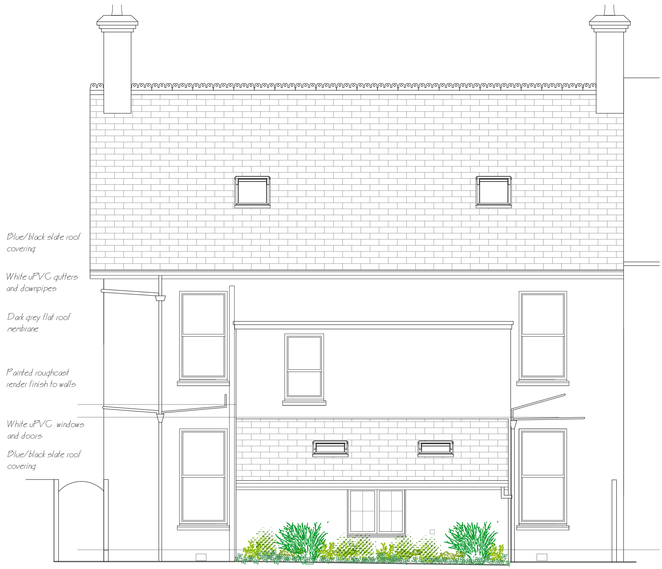
North Elevation. Scale - 1:50.