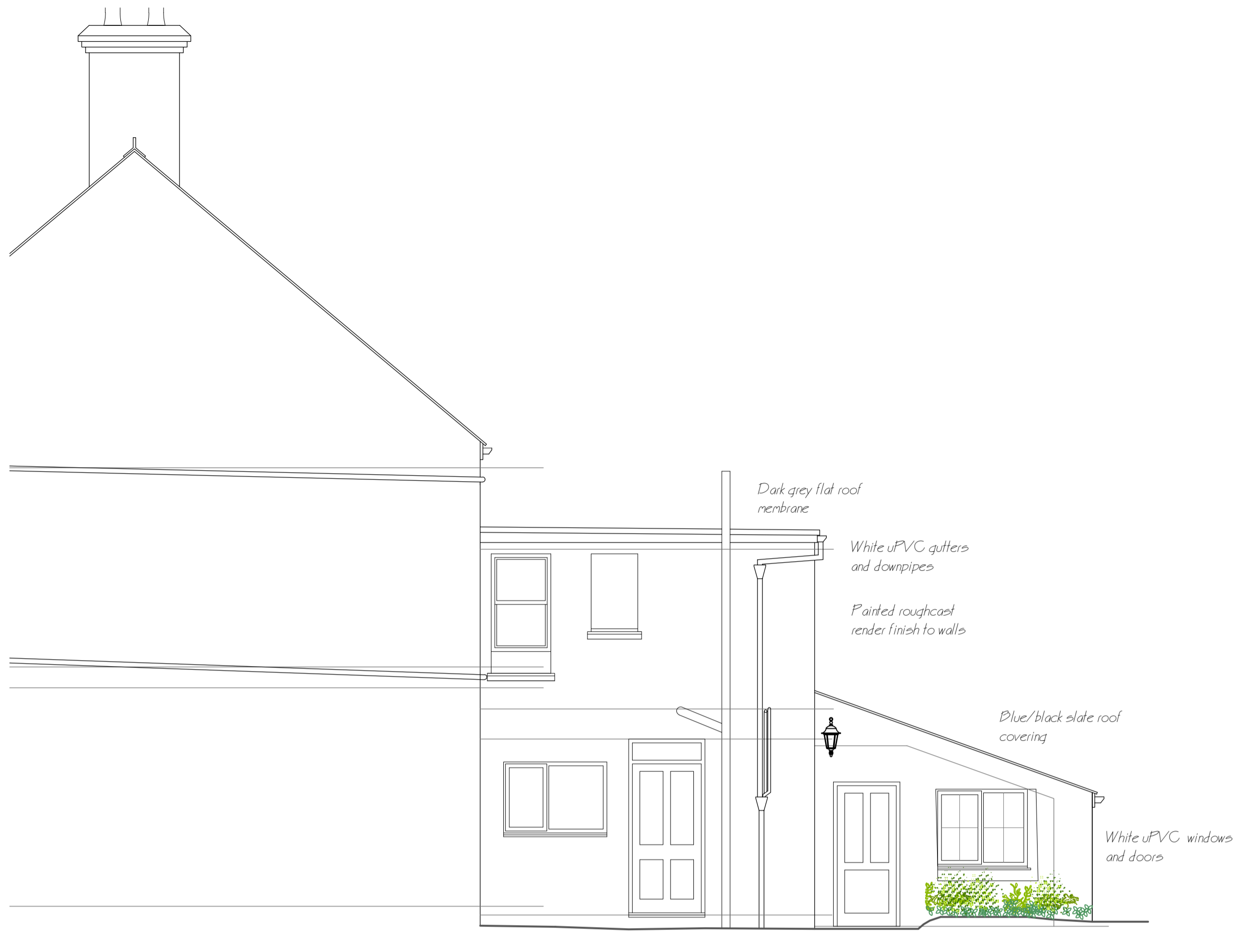
East Elevation. Scale - 1:50.