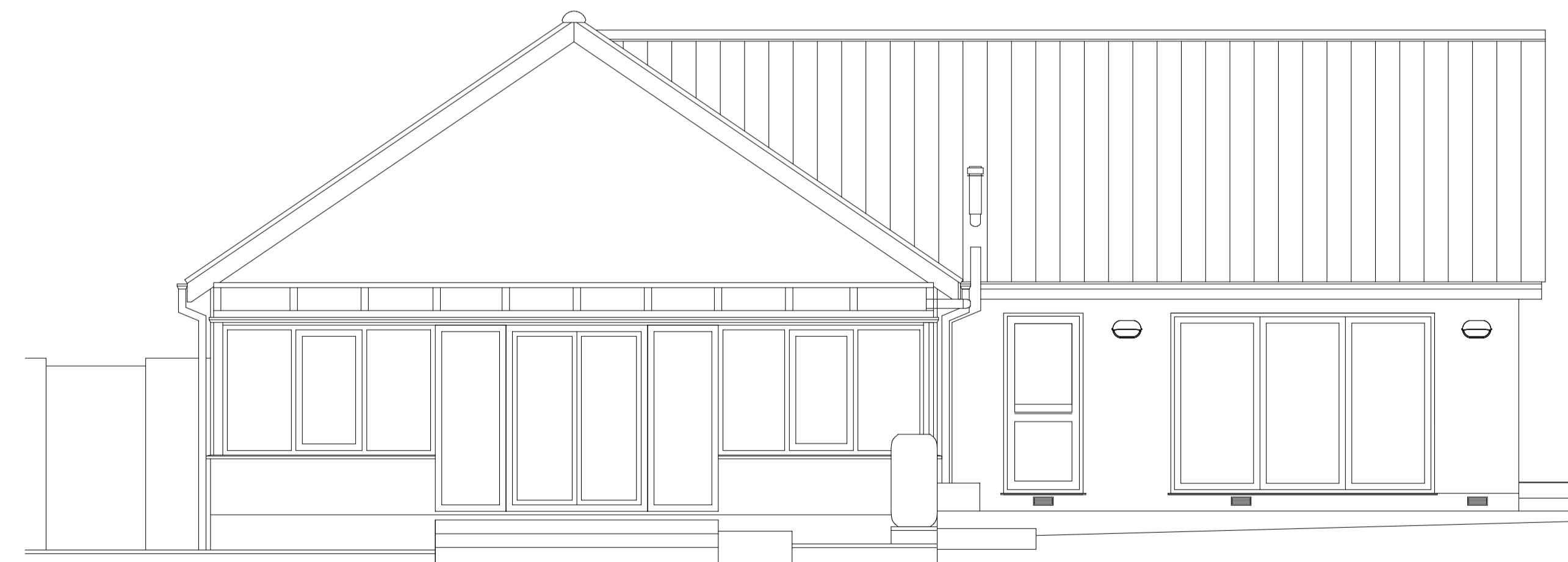
West Elevation 1:50 @ A1 - 1:100 @ A3