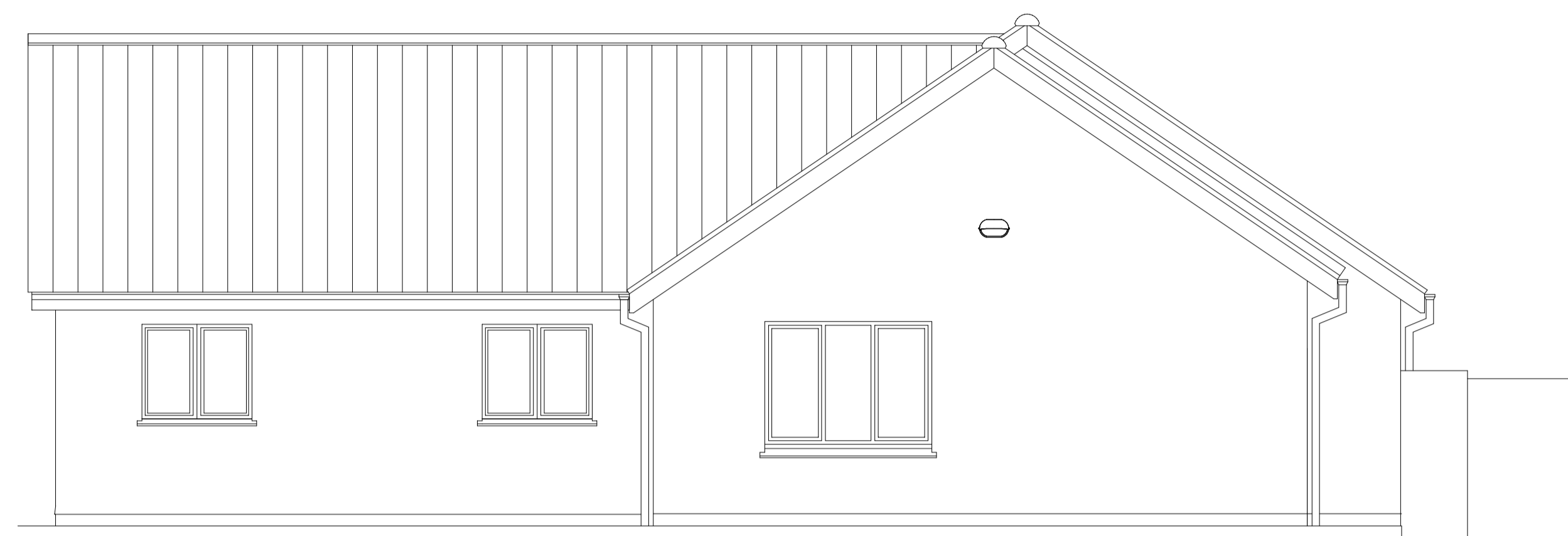
East Elevation 1:50 @ A1 - 1:100 @ A3