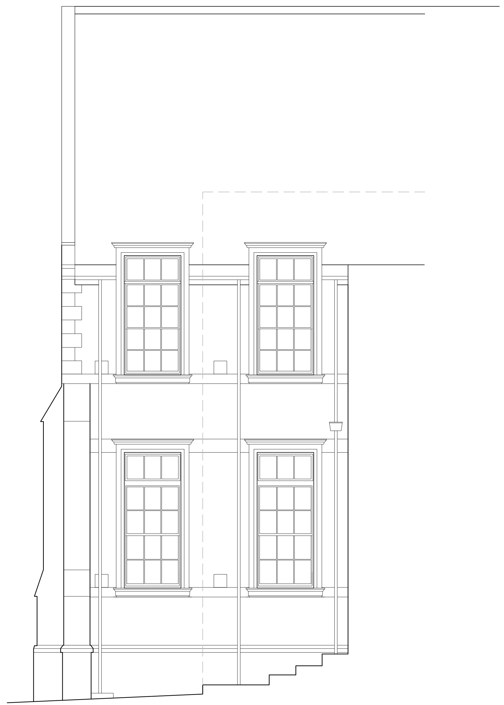
Existing Part East Elevation Scale 1:50

Replace existing windows with fire resisting alternatives ensuring they are fixed shut. Colour and appearance to be confirmed