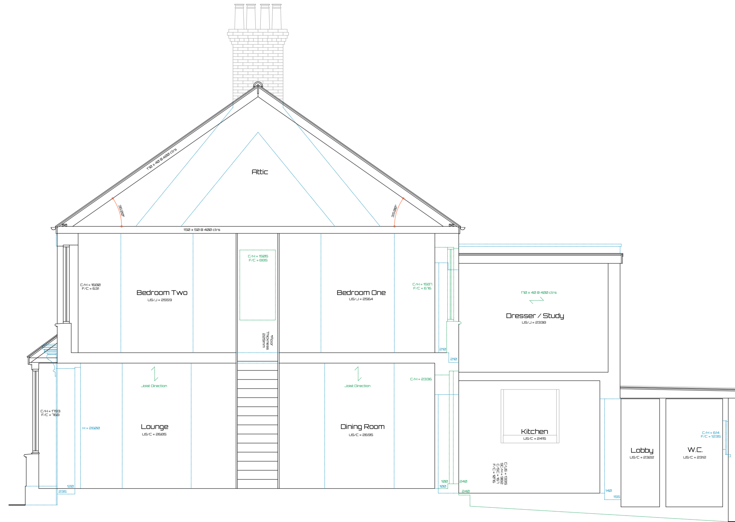
General Cross Section

COPYRIGHT The copyright of this drawing is the property of Matt's Architectural Technology Limited and may not be re-produced without permission. GENERAL NOTES Figured dimensions are to be used in preference to any scaled dimensions, all contractors or sub-contractors must check all dimensions on site. Any discrepancies between this drawing and site, must be made aware immediately.