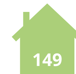
Affordable Housing Completions*

(as at end of Q4 2020) These are across 127 sites and 19 dwellings were completed in Q4 2020 alone