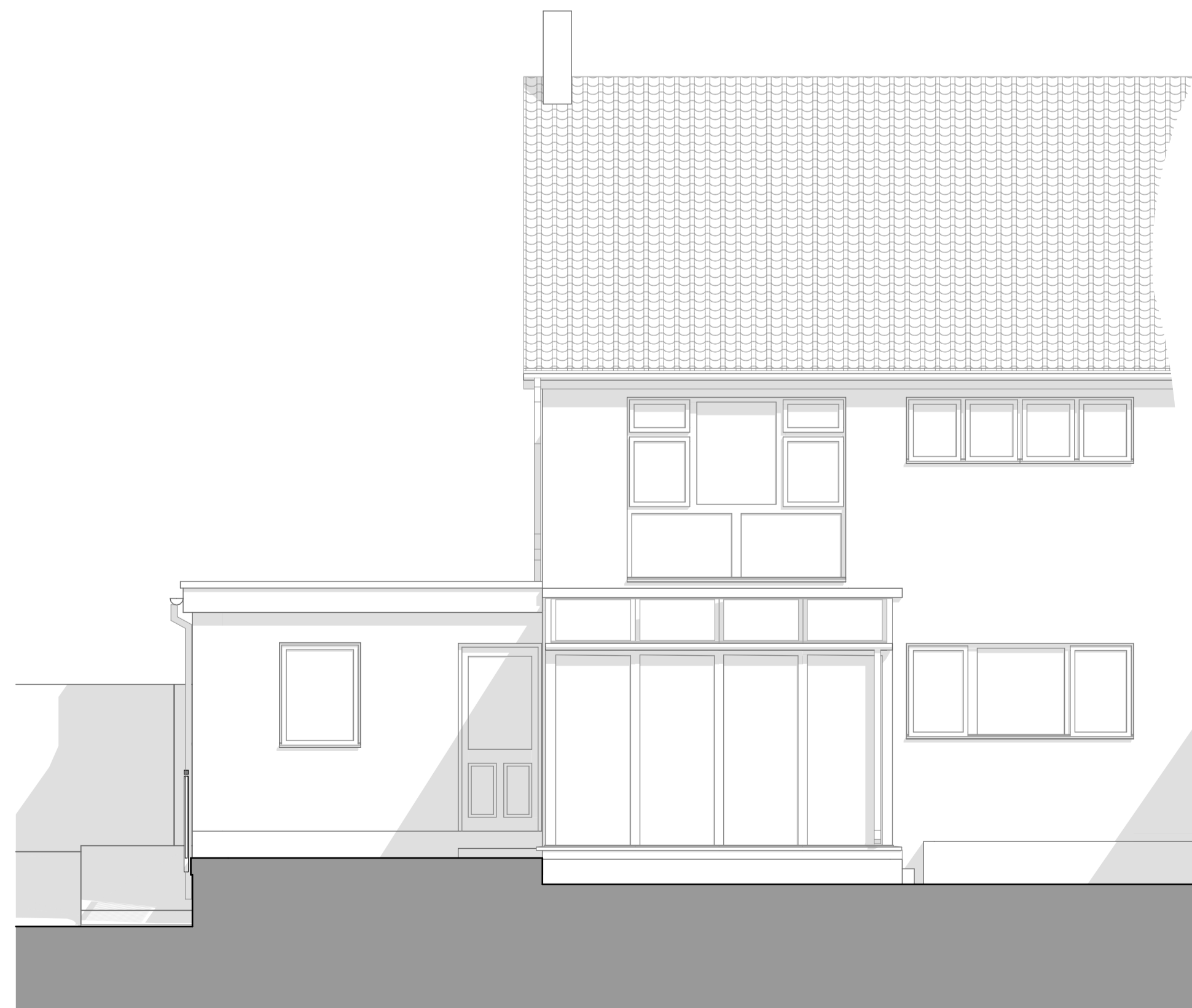
West Elevation 1:50