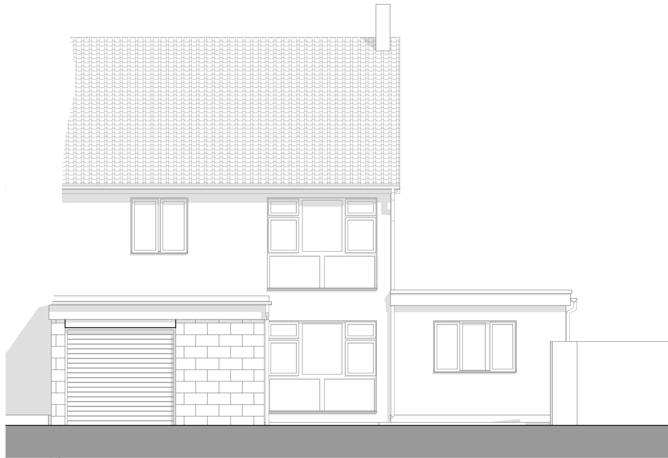
East Elevation 1:50