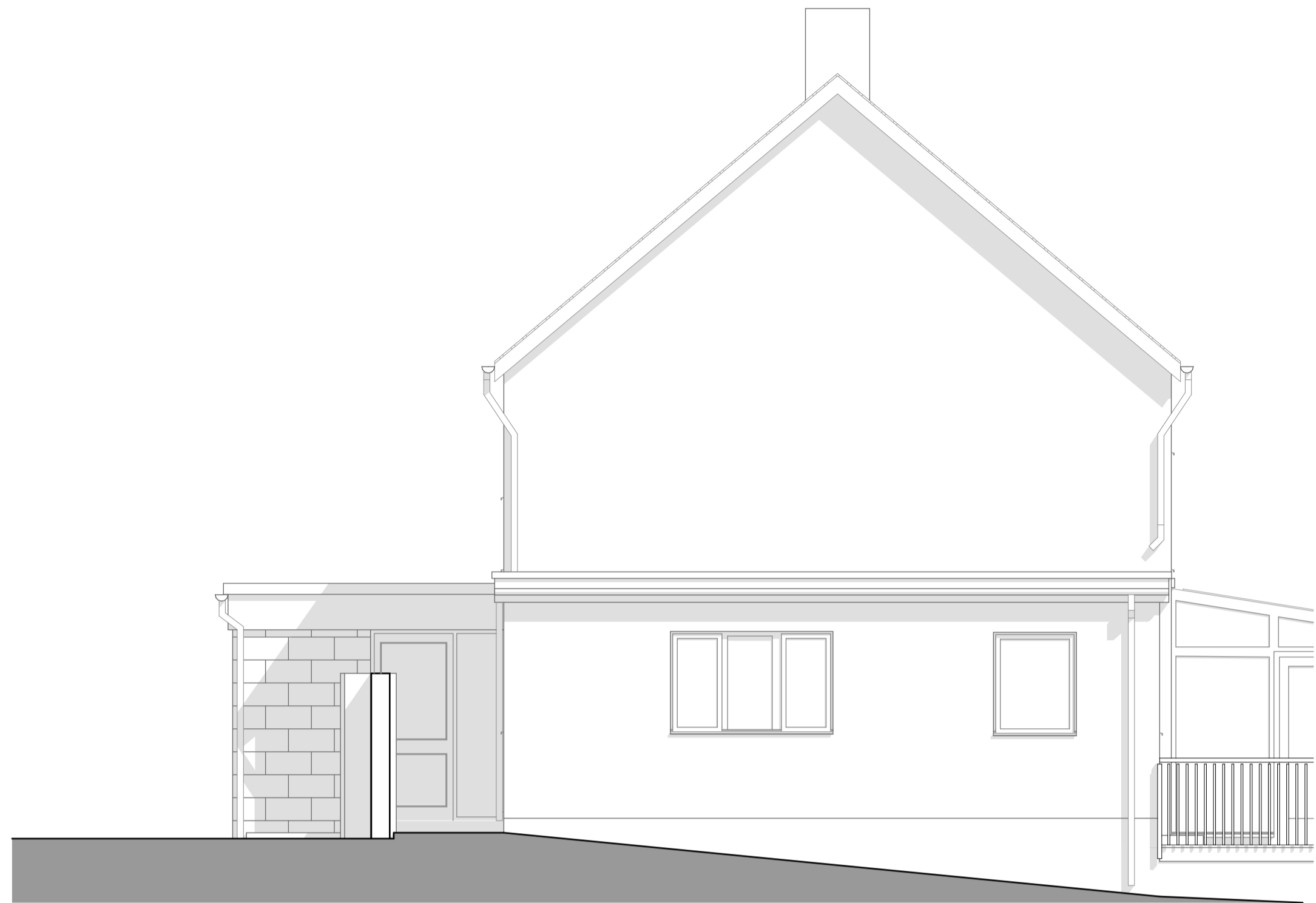
North Elevation 1:50