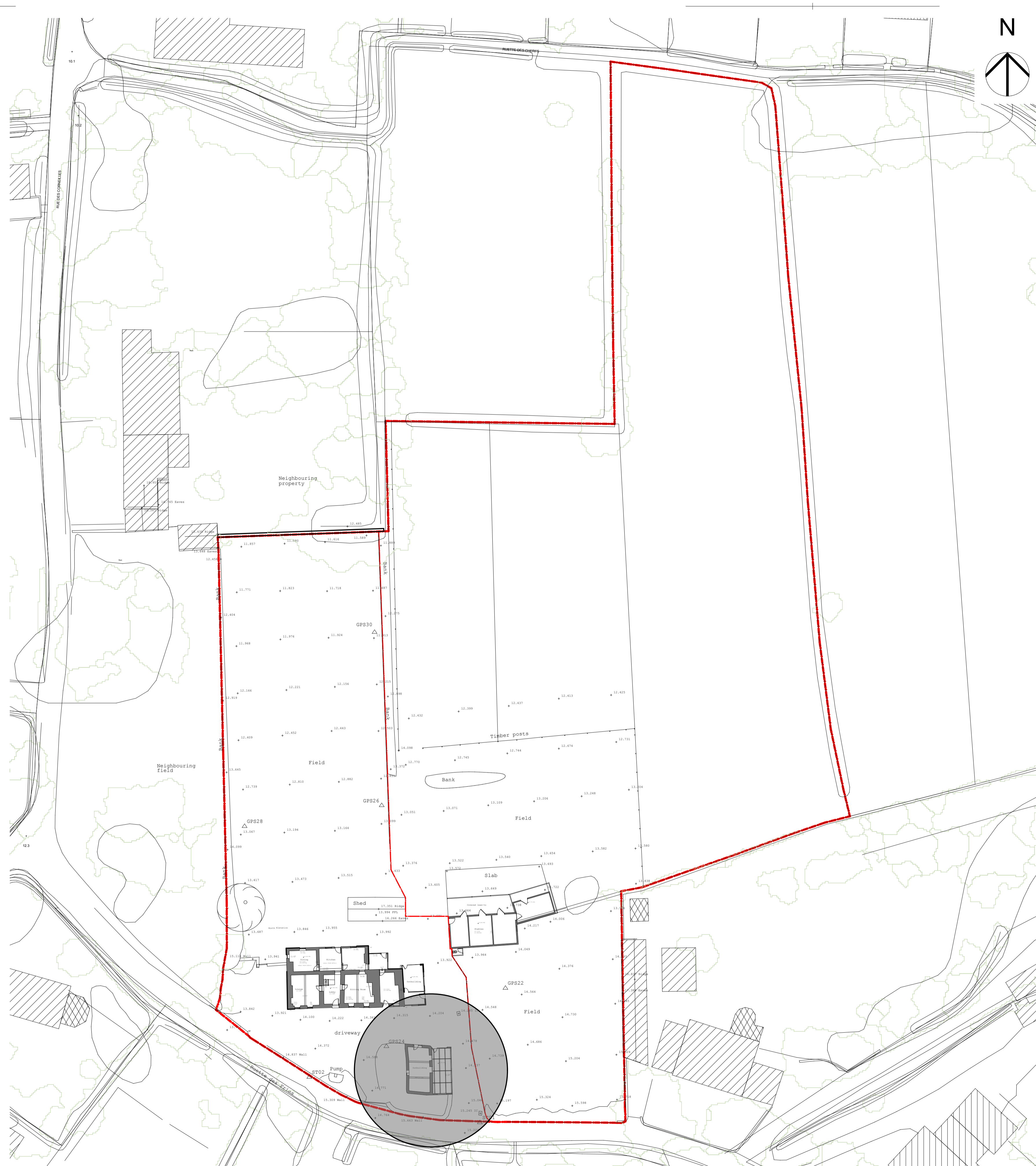
SITE BLOCK PLAN