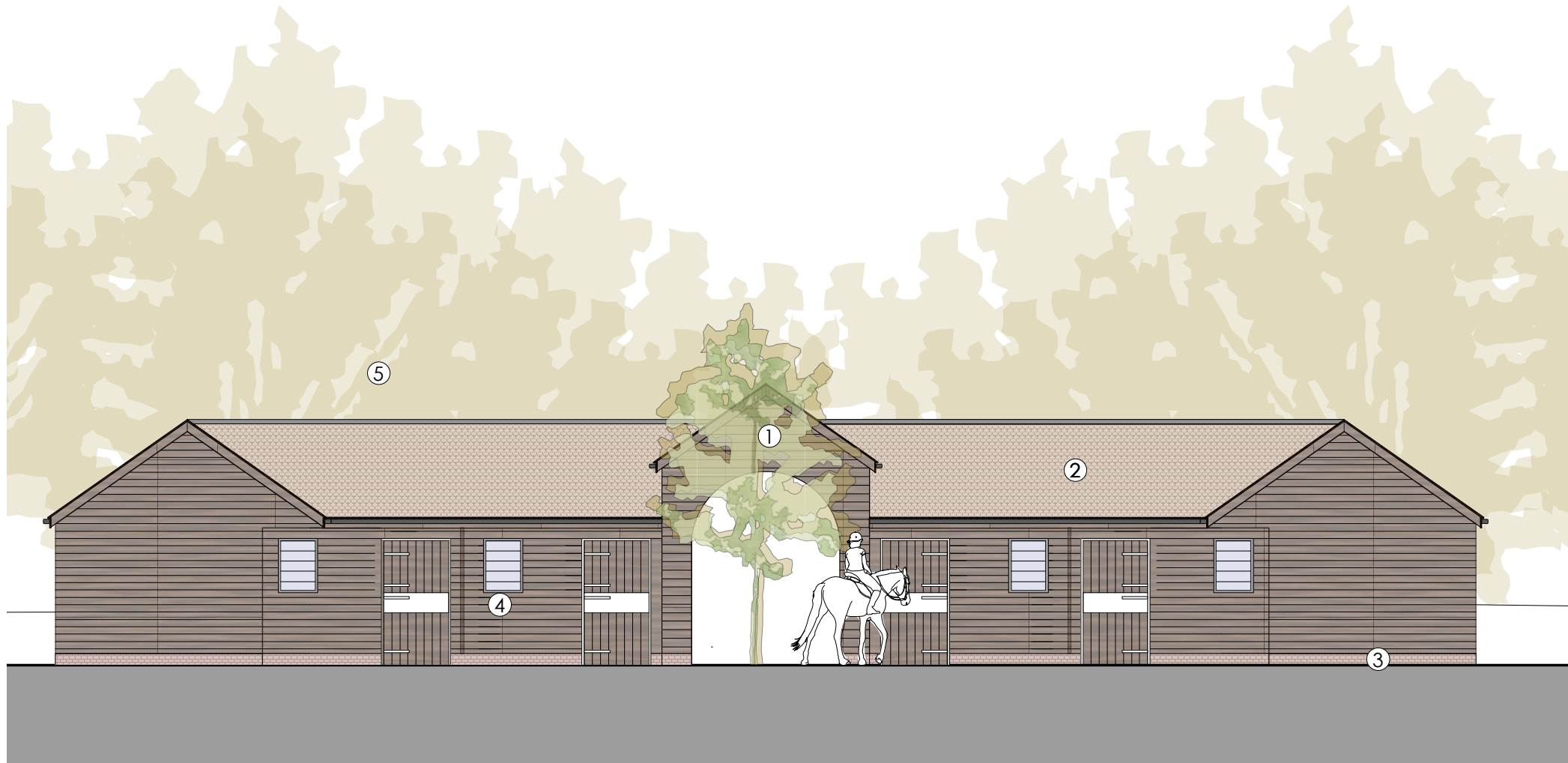
Front Elevation (South)