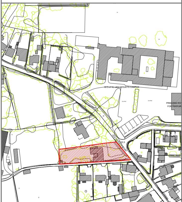
Site Plan Scale 1:2500 Copyright © 2020 States of Guernsey & Digimap Limited Licence Number: 118

COPYRIGHT The copyright of this drawing is the property of Matt's Architectural Technology Limited and may not be re-produced without permission. GENERAL NOTES Figured dimensions are to be used in preference to any scaled dimensions, all contractors or sub-contractors must check all dimensions on site. Any discrepancies between this drawing and site, must be made aware immediately.