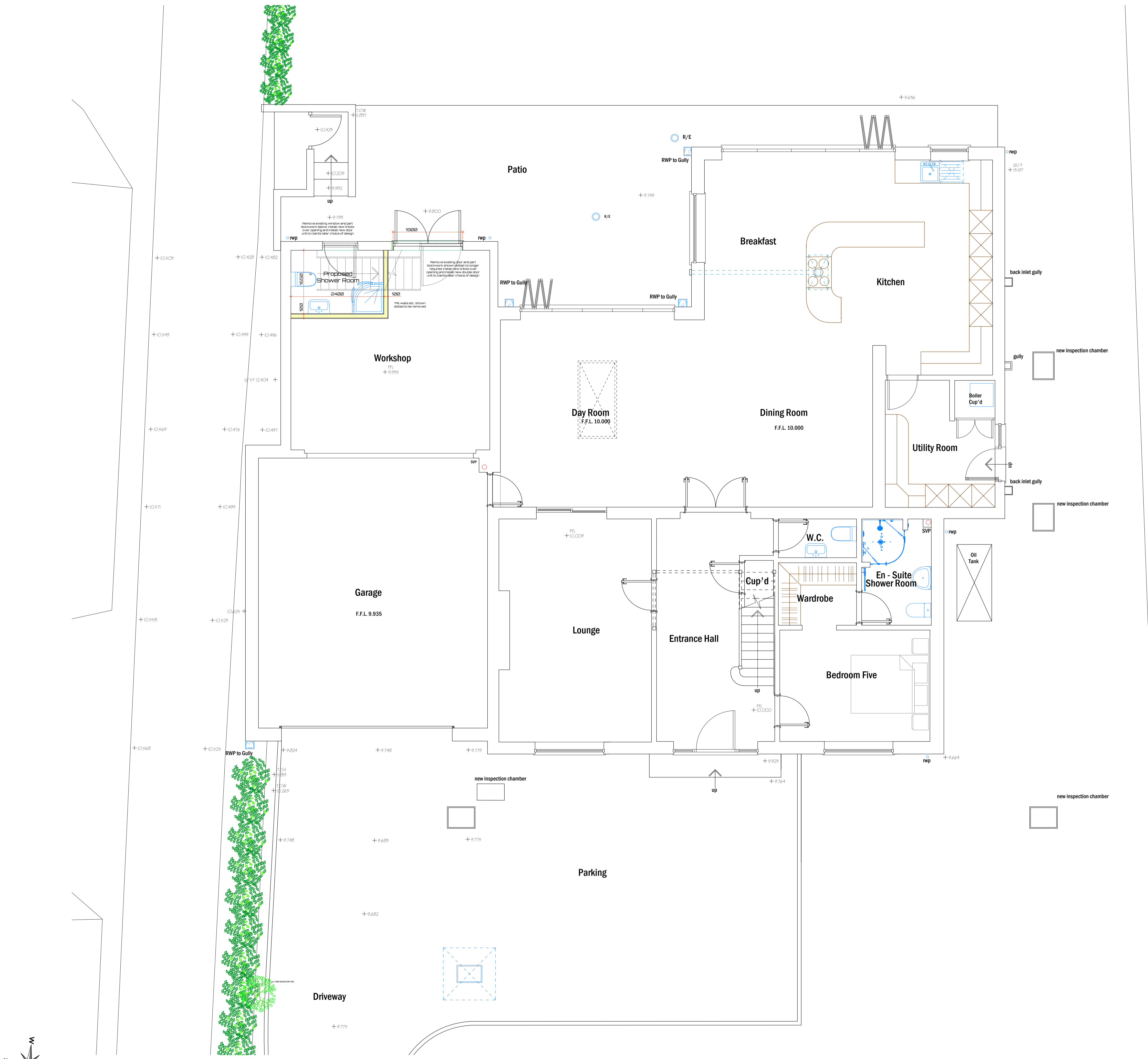
Ground Floor / Part Site Layout Plan

COPYRIGHT The copyright of this drawing is the property of Matt's Architectural Technology Limited and may not be re-produced without permission. GENERAL NOTES Figured dimensions are to be used in preference to any scaled dimensions, all contractors or sub-contractors must check all dimensions on site. Any discrepancies between this drawing and site, must be made aware immediately.