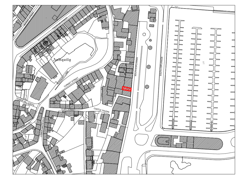
Location Plan 1:2500

Copyright 2019 States of Guernsey/Digimap Ltd Digimap licence No:109