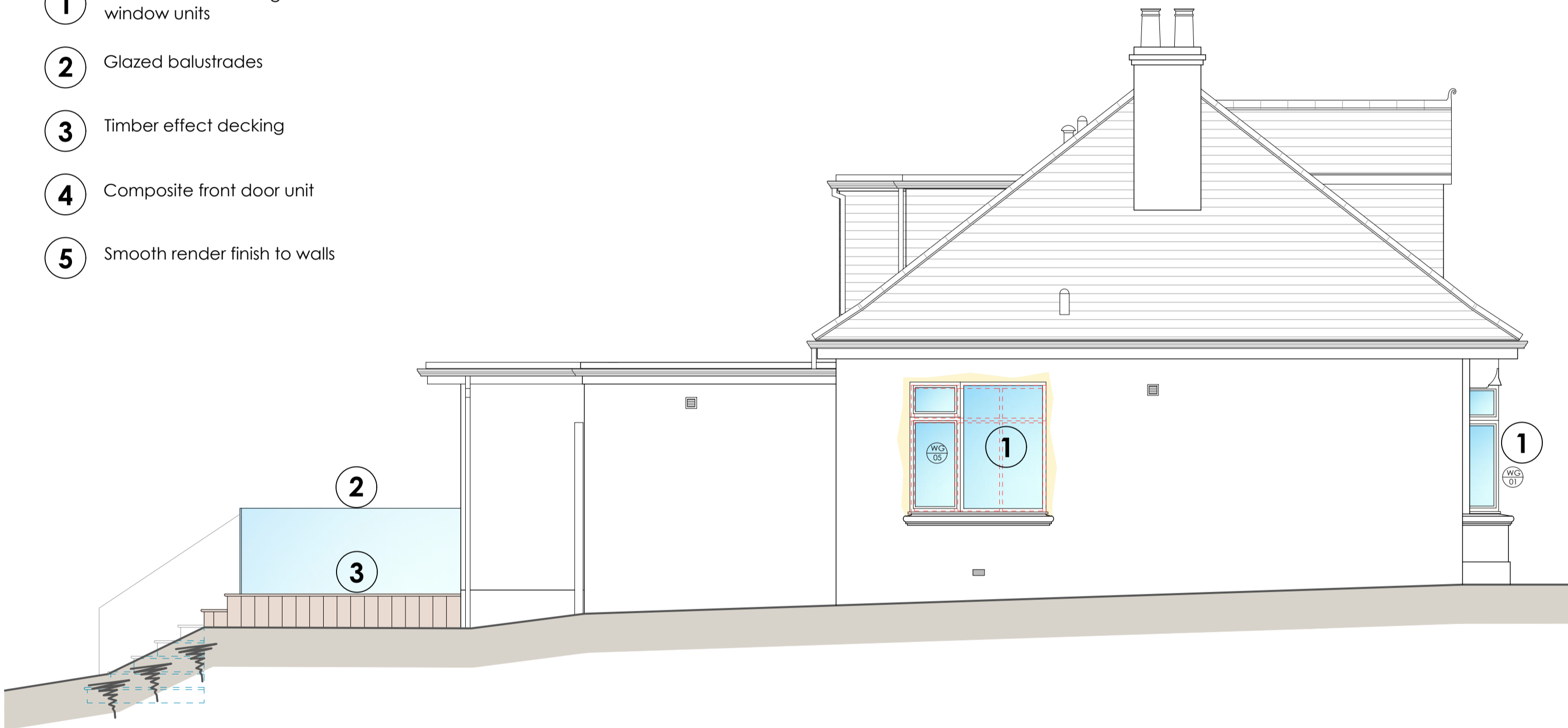
West Elevation 1:50