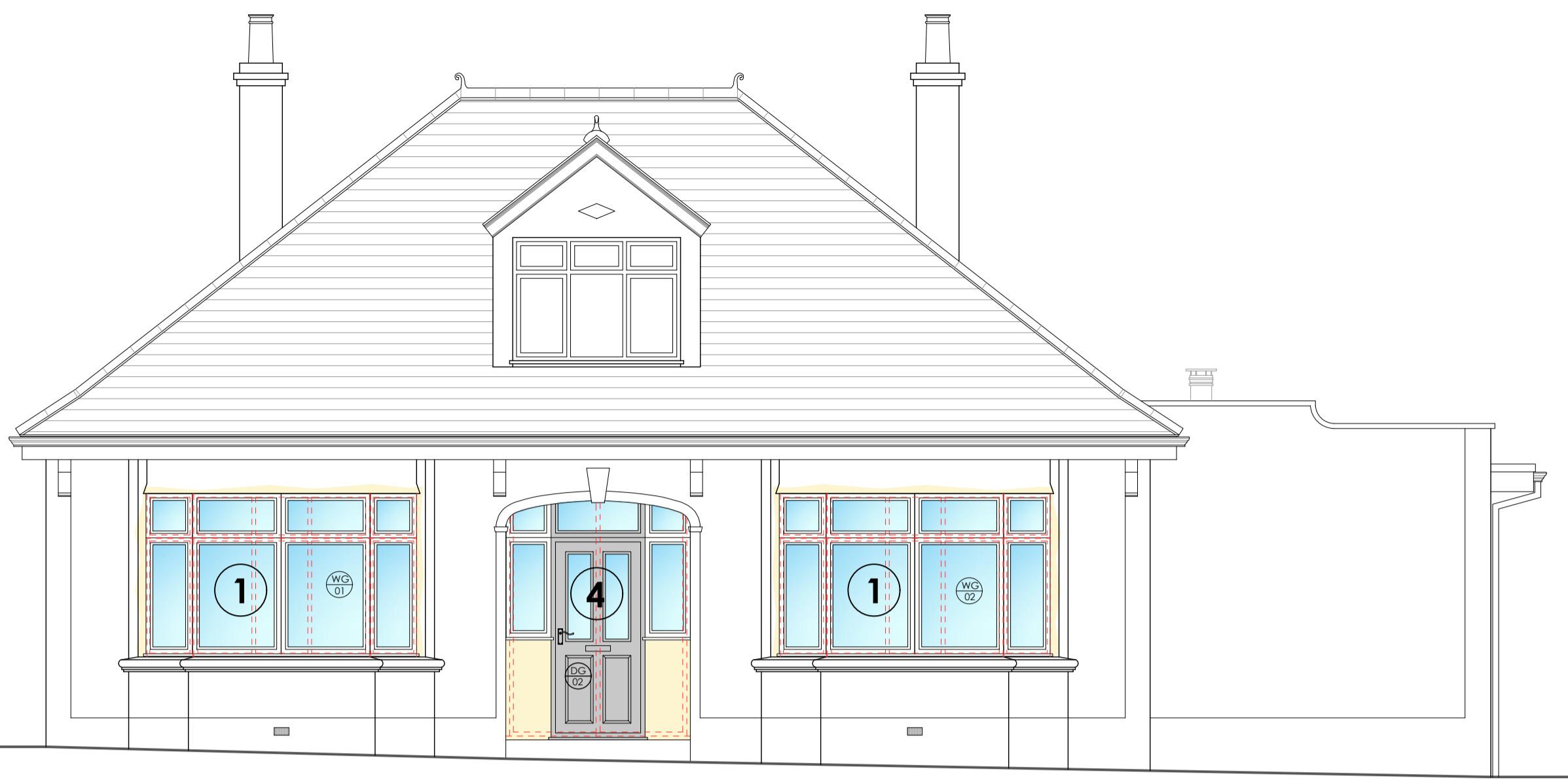
North Elevation 1:50