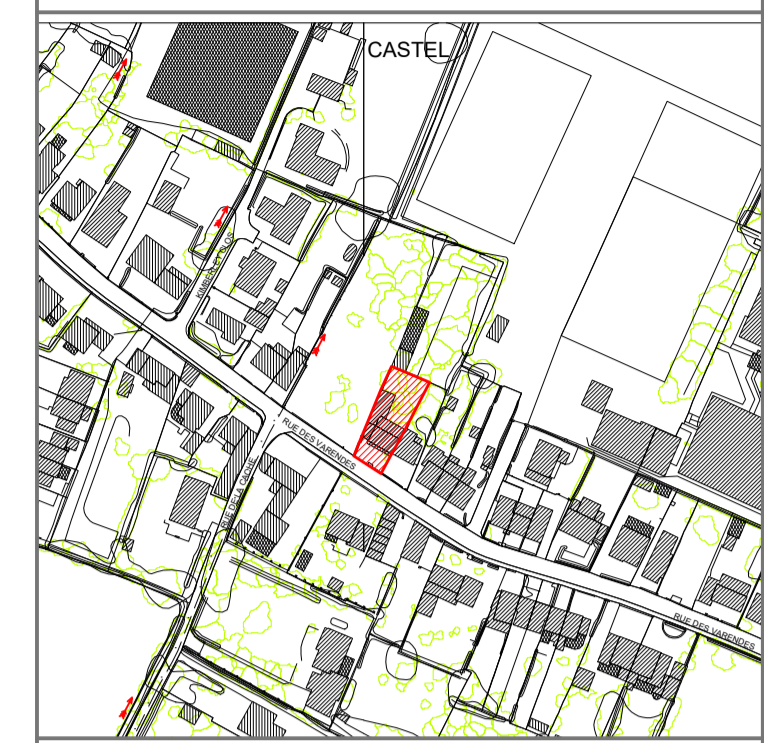
Site Plan Scale: 1:2500 Copyright 2019 States Of Guernsey & Digmap Limited - Licence Number: F10

COPYRIGHT The copyright of this drawing is the property of Matt's Architectural Technology Limited and may not be re-produced without permission. GENERAL NOTES Figured dimensions are to be used in preference to any scaled dimensions, all contractors or sub contractors must check all dimensions on site. Any discrepancies between this drawing and site, mat must be made aware immediately.