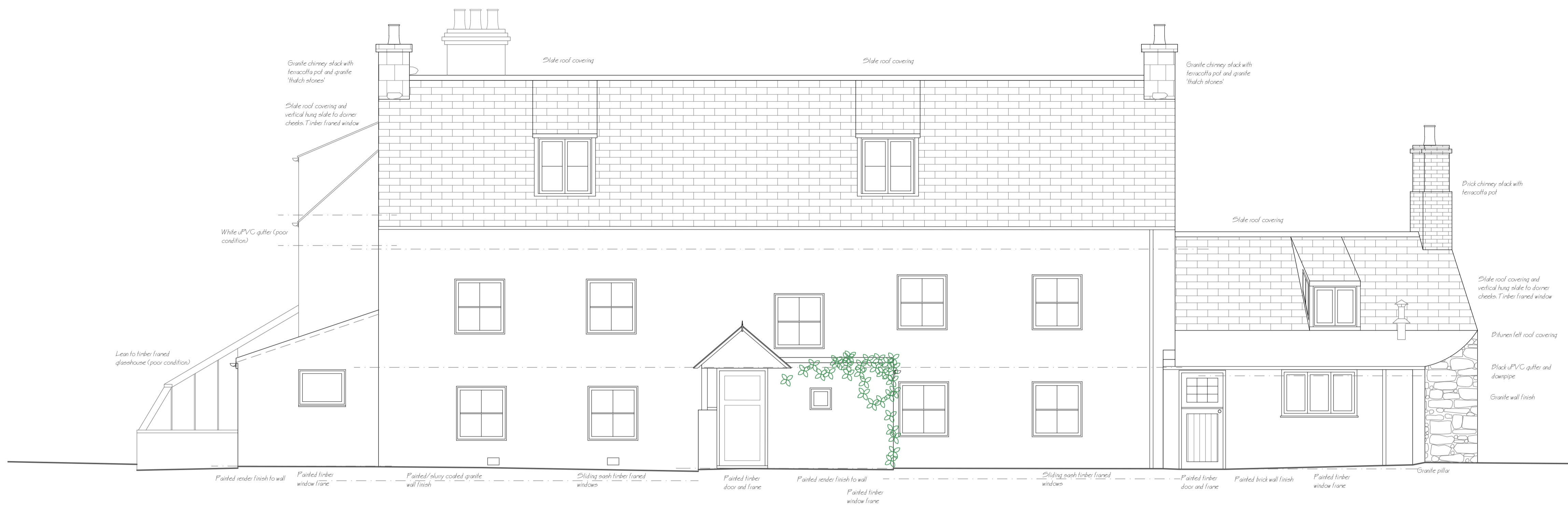
South Elevation Scale - 1:50.