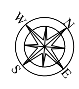
Overall Site Plan. Scale - 1:200.

This drawing is to be read in-conjunction with drawing No's: 1403-SK-01A, 02 & 03A.