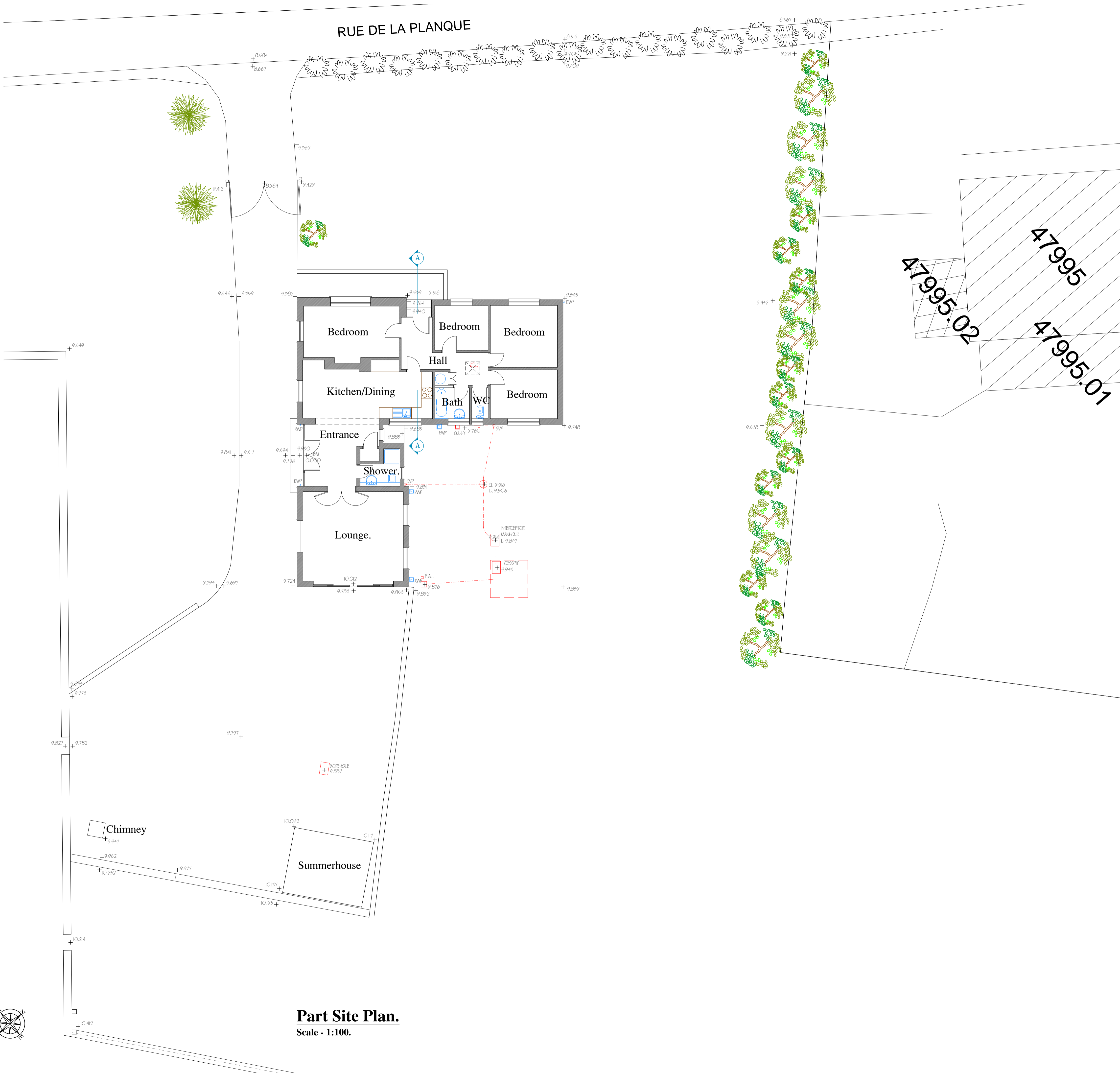
Part Site Plan. Scale - 1:100.

THE COPYRIGHT OF THIS DRAWING IS THE PROPERTY OF DIRECT ARCHITECTURAL SOLUTIONS LTD.