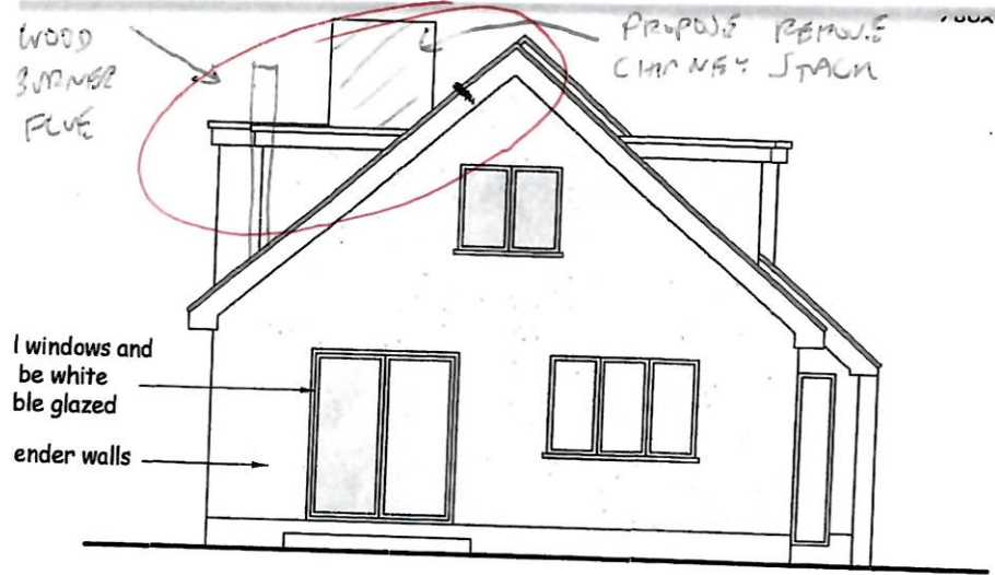
Proposed South-East Elevation