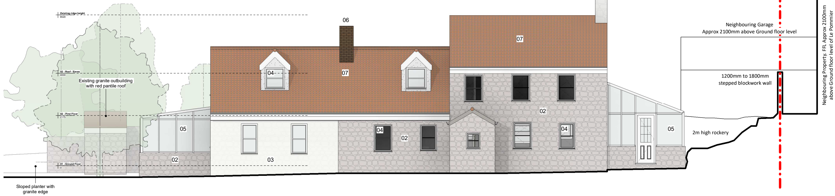
01: Existing South Elevation scale 1:100