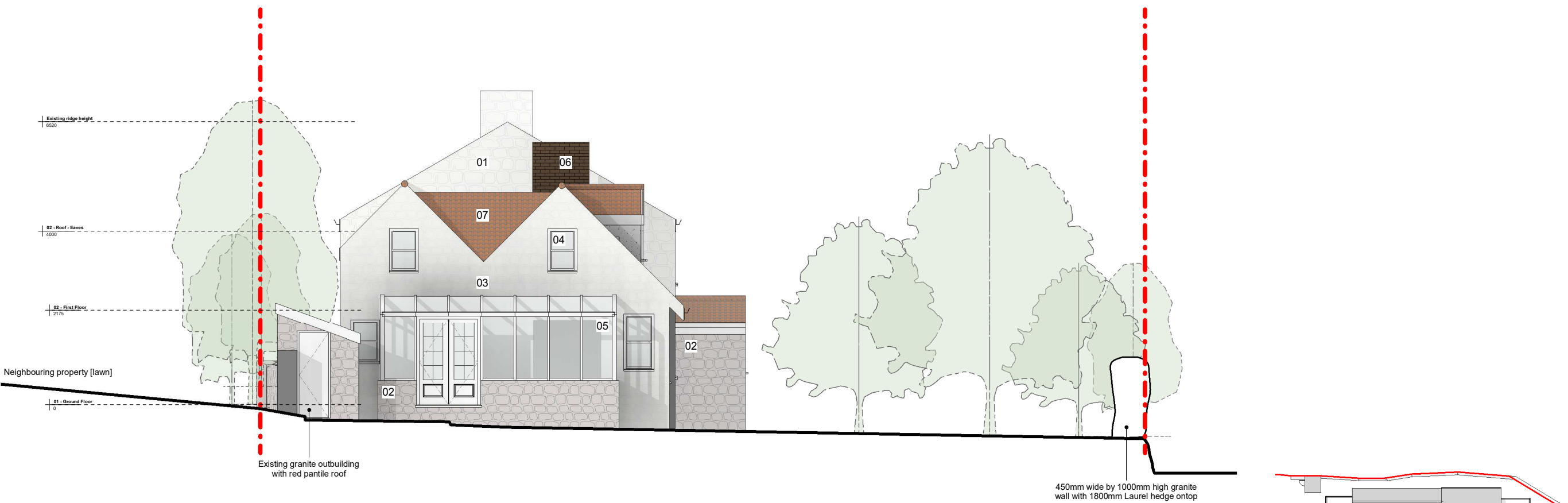
02: Existing West Elevation scale 1:100