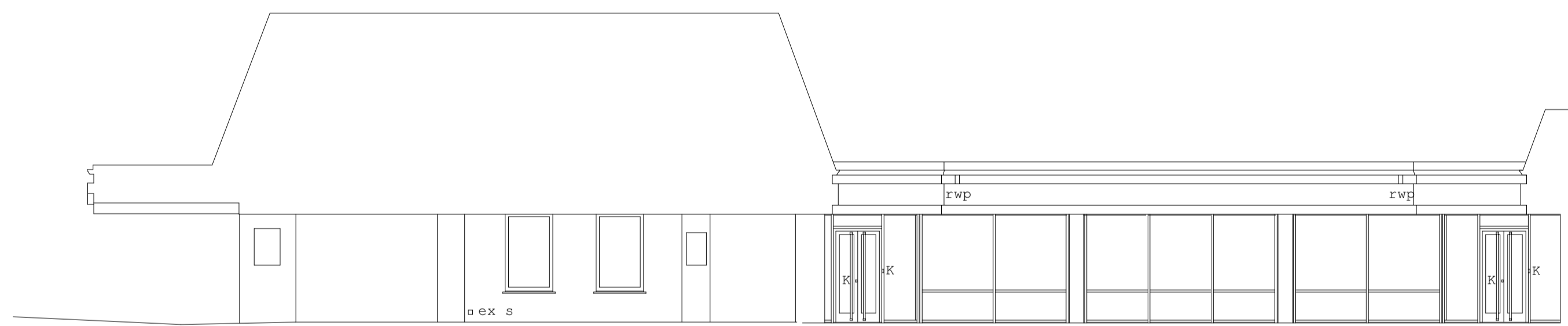
2 Existing courtyard South elevation 1 : 100