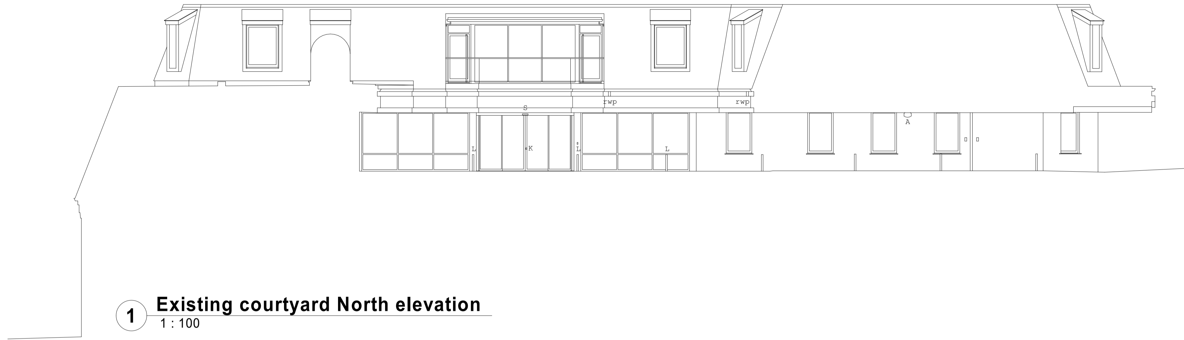
1 Existing courtyard North elevation 1 : 100