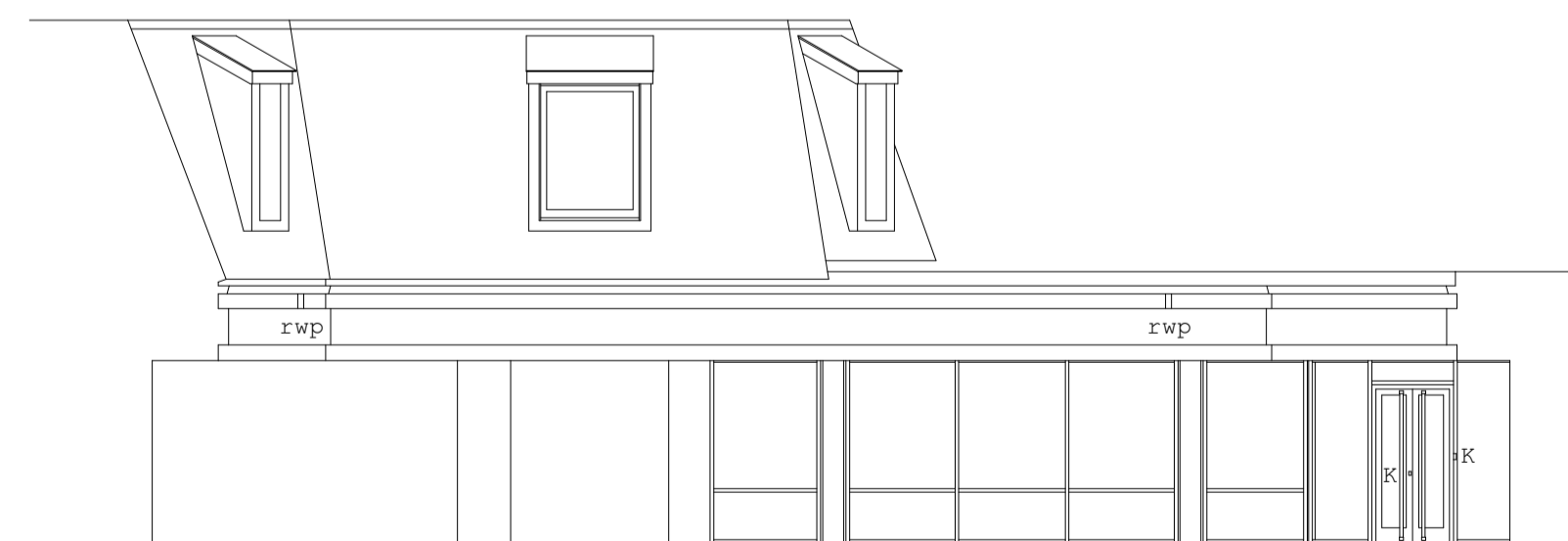
3 Existing courtyard East elevation 1 : 100