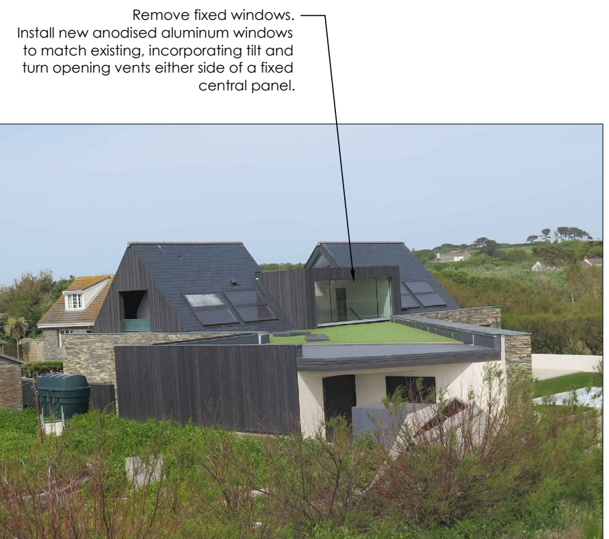
Photograph No. 1 South Elevation of Bellagio as viewed from the coast road looking due north