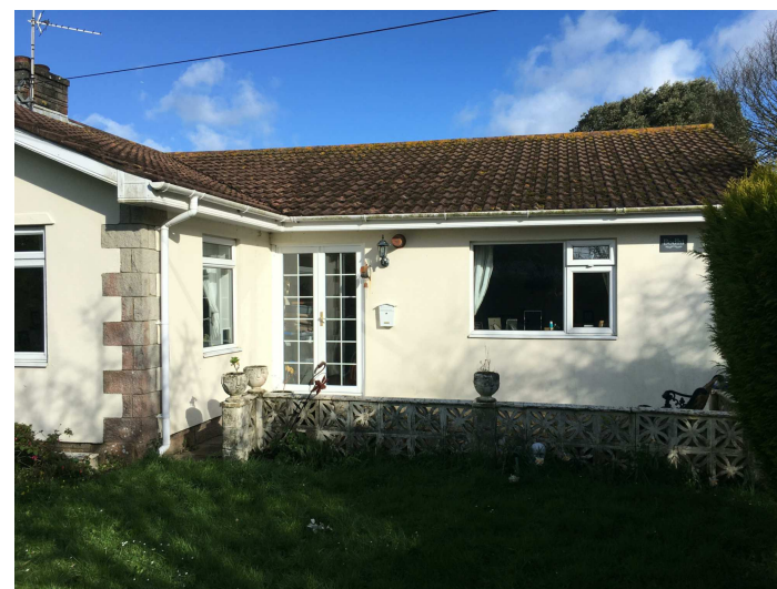
Existing Front View of Property