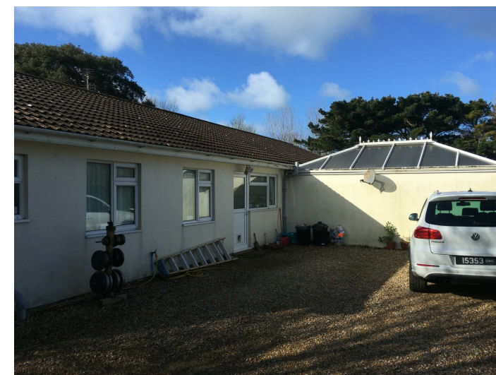
Existing Rear View of Property

THE COPYRIGHT OF THIS DRAWING IS VESTED IN SOUP AND IT MAY NOT BE REPRODUCED IN WHOLE OR PART OR USED FOR THE MANUFACTURE OF ANY ARTICLE WITHOUT THE EXPRESS PERMISSION OF THE COPYRIGHT HOLDERS.