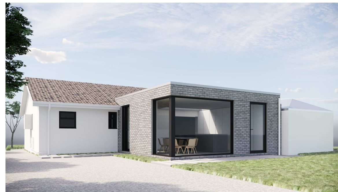
Visualisation of proposed rear extension

THE COPYRIGHT OF THIS DRAWING IS VESTED IN SOUP AND IT MAY NOT BE REPRODUCED IN WHOLE OR PART OR USED FOR THE MANUFACTURE OF ANY ARTICLE WITHOUT THE EXPRESS PERMISSION OF THE COPYRIGHT HOLDERS.