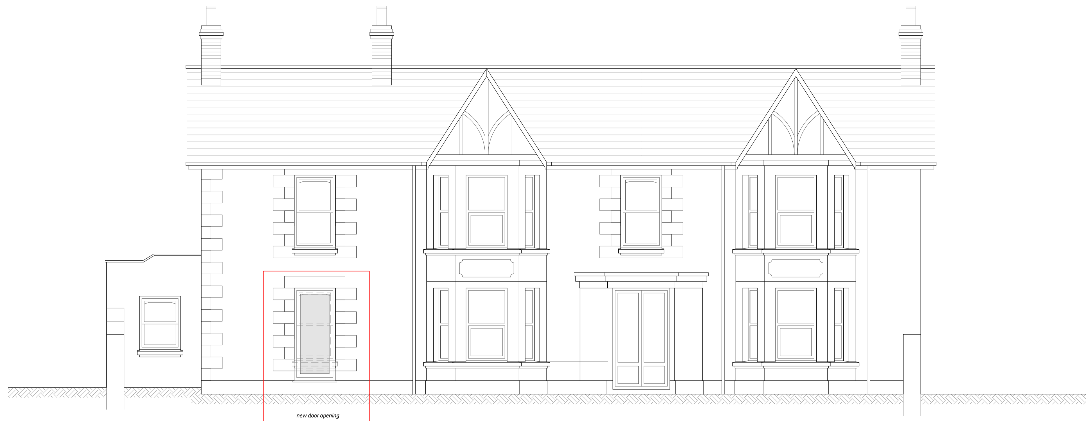
north east elevation