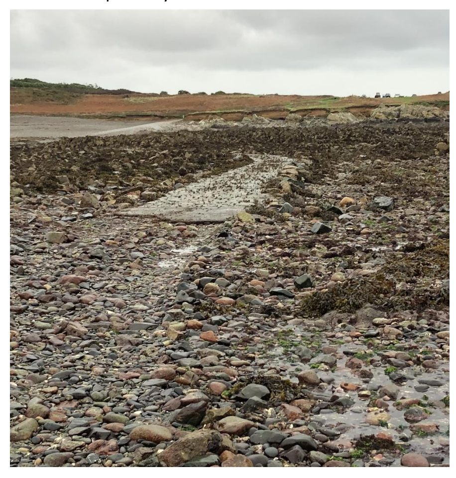
Photo 1: Change is surface from shingle to cobble. Shingle has been washed onto the cobbled causeway.

The causeway has changes in surface, it is part cobbled, part shingle and part sand as shown in the pictures below. Wet stones and cobble can be slippery. As it is a dynamic environment, shingle and large rocks can often be washed onto the pathway.