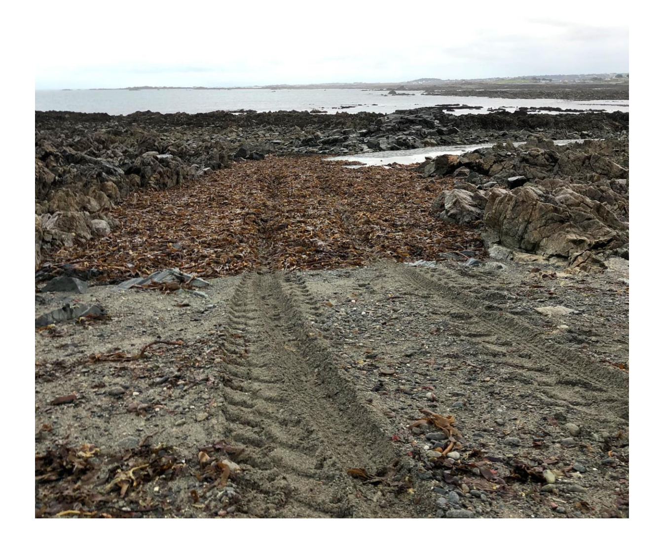
Photo 2: Change is surface from sand to cobble. Large piles of seaweed have been washed onto the causeway.

The access from the causeway to Lihou is via a steep incline on a sand bay.