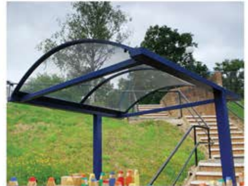
Rounded Roof Design