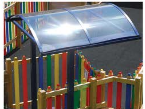
Hot Dipped Galvanized

Broxap Limited, Rowhurst Industrial Estate, Chesterton, Newcastle-under-Lyme, Staffordshire ST5 6BD Tel: +44 (0)1782 564411 • Fax: +44 (0)1782 565357/562546 • E.mail: sales@broxap.com • Web: www.broxap.com