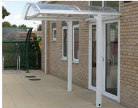
Anti-Climb End Frames