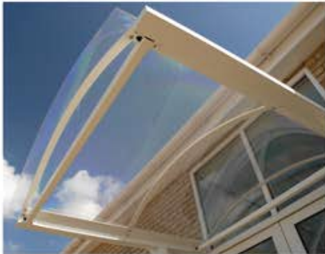
ClearView PETg UV Sheeting