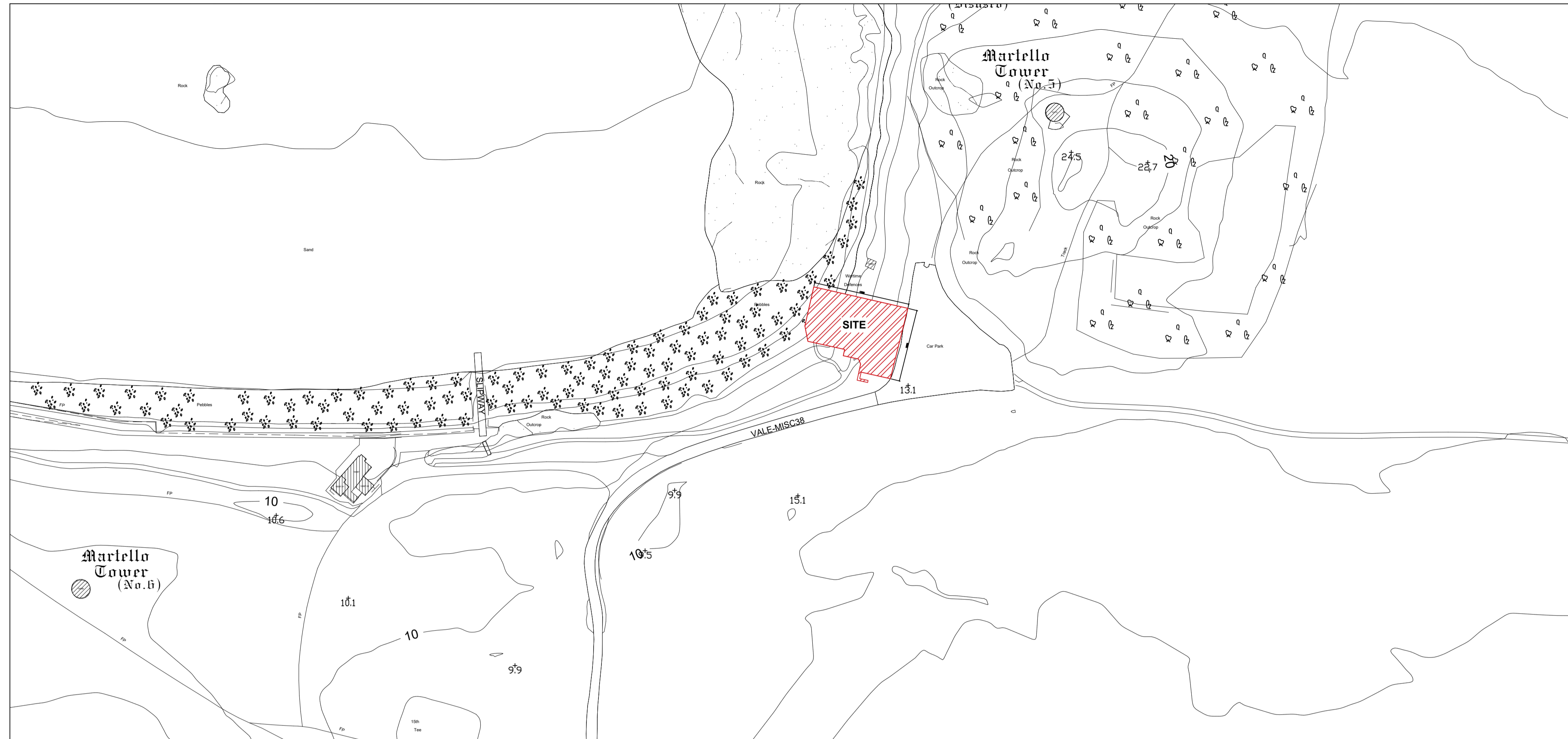
Site Location 1:500