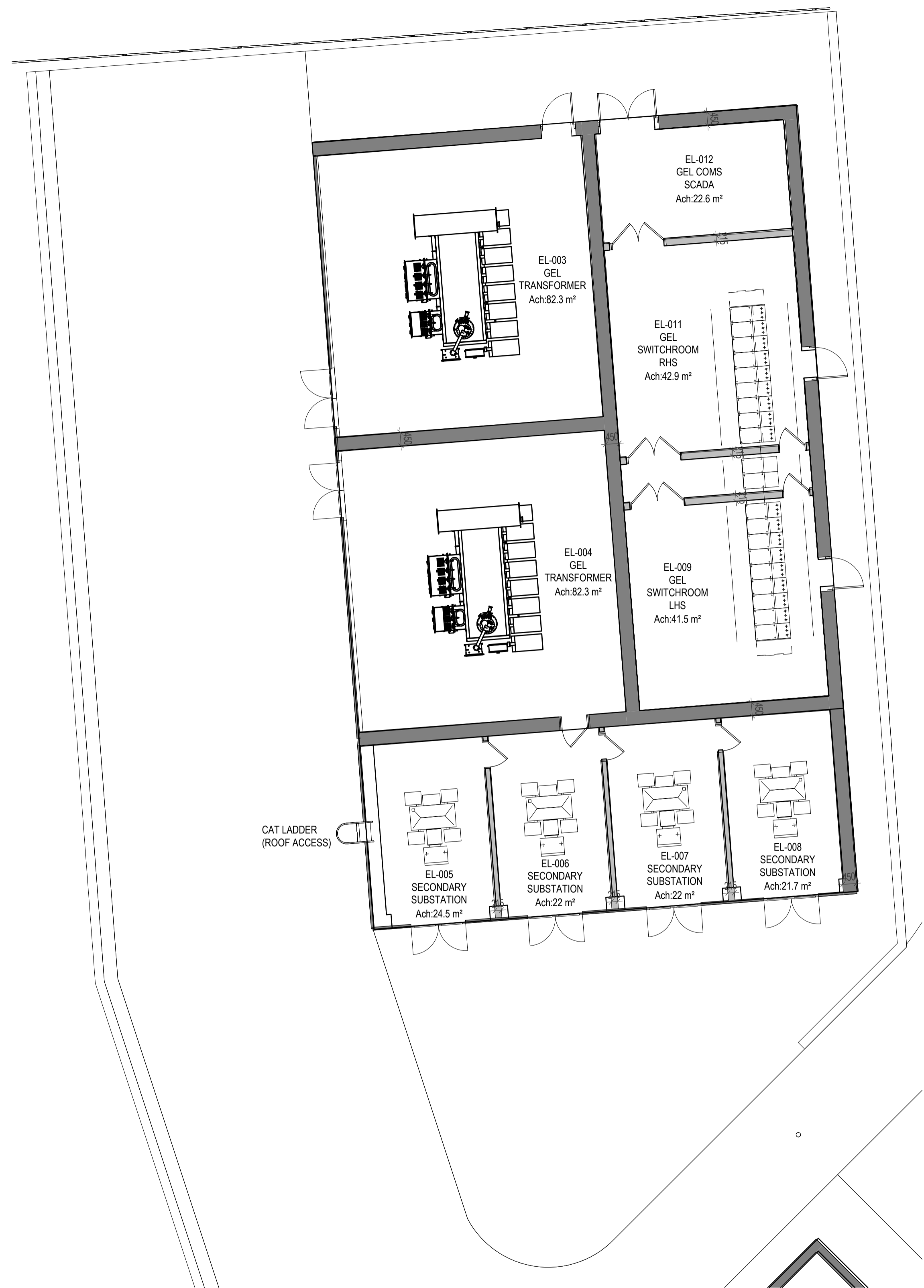
1 SUBSTATION BUILDING 1 (GEL) 1 : 100