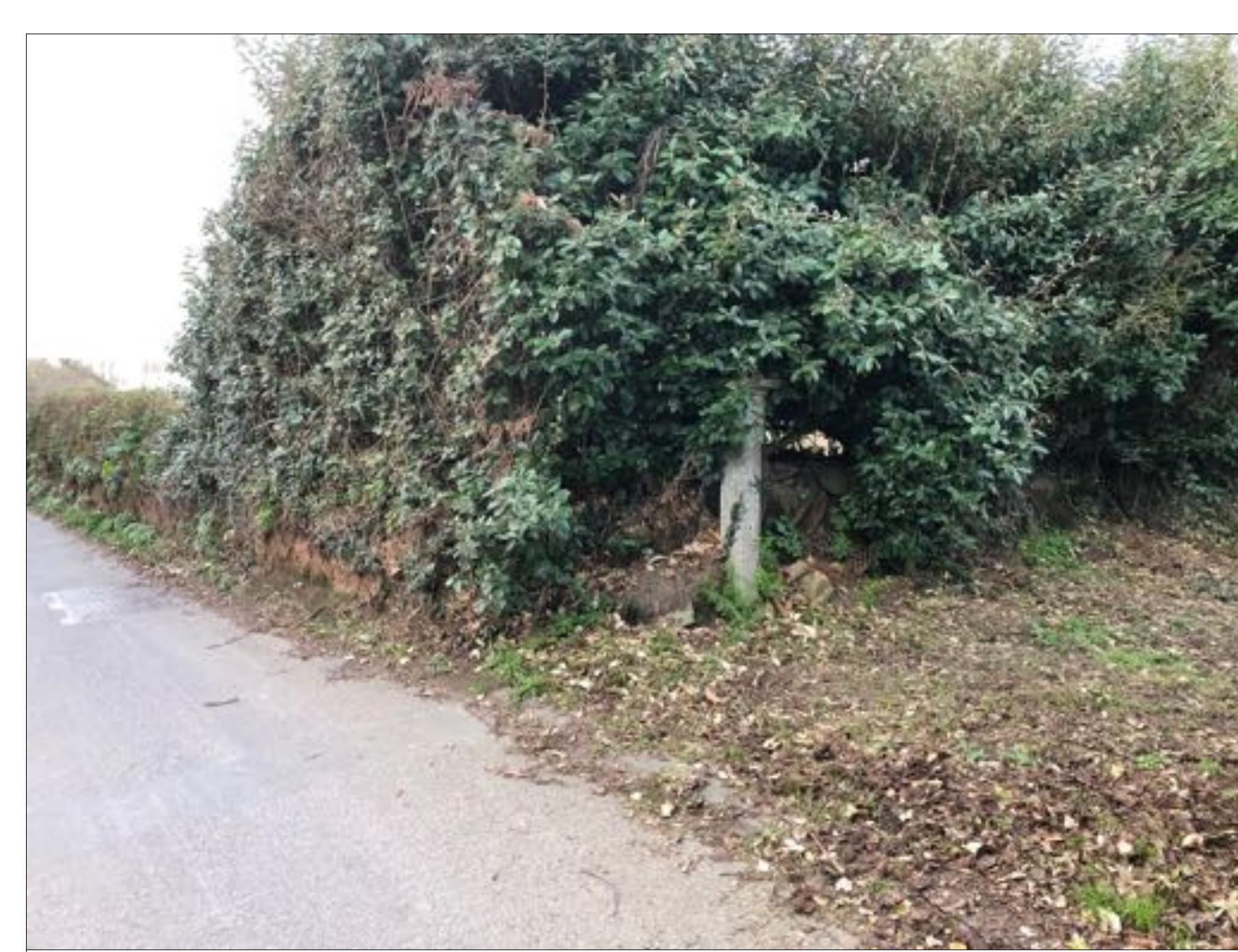
View of existing entrance from Les Reines looking South