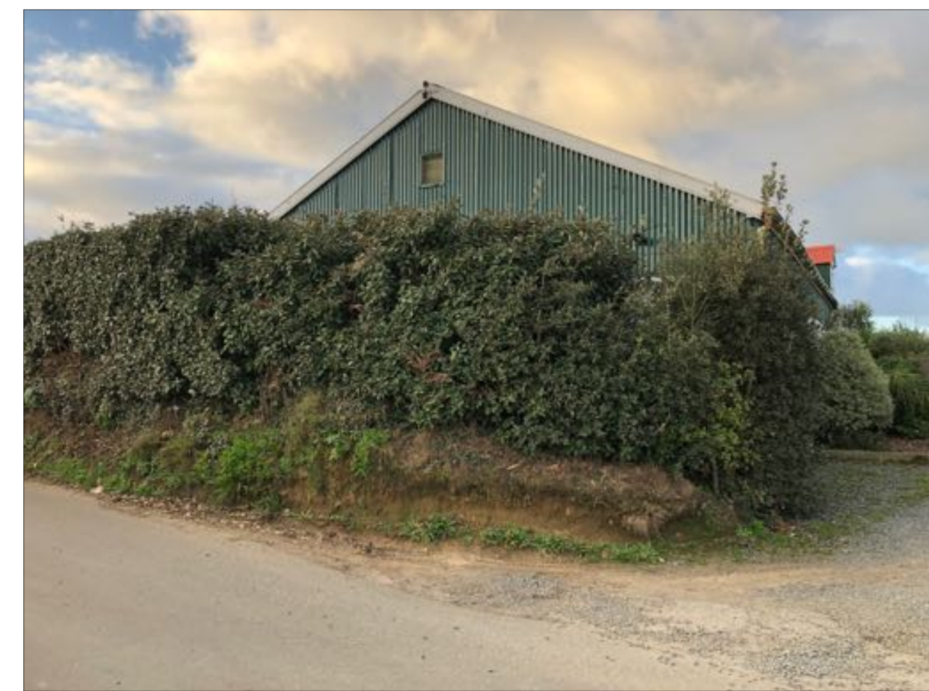
Entrance to Petersfield Vinery and existing building