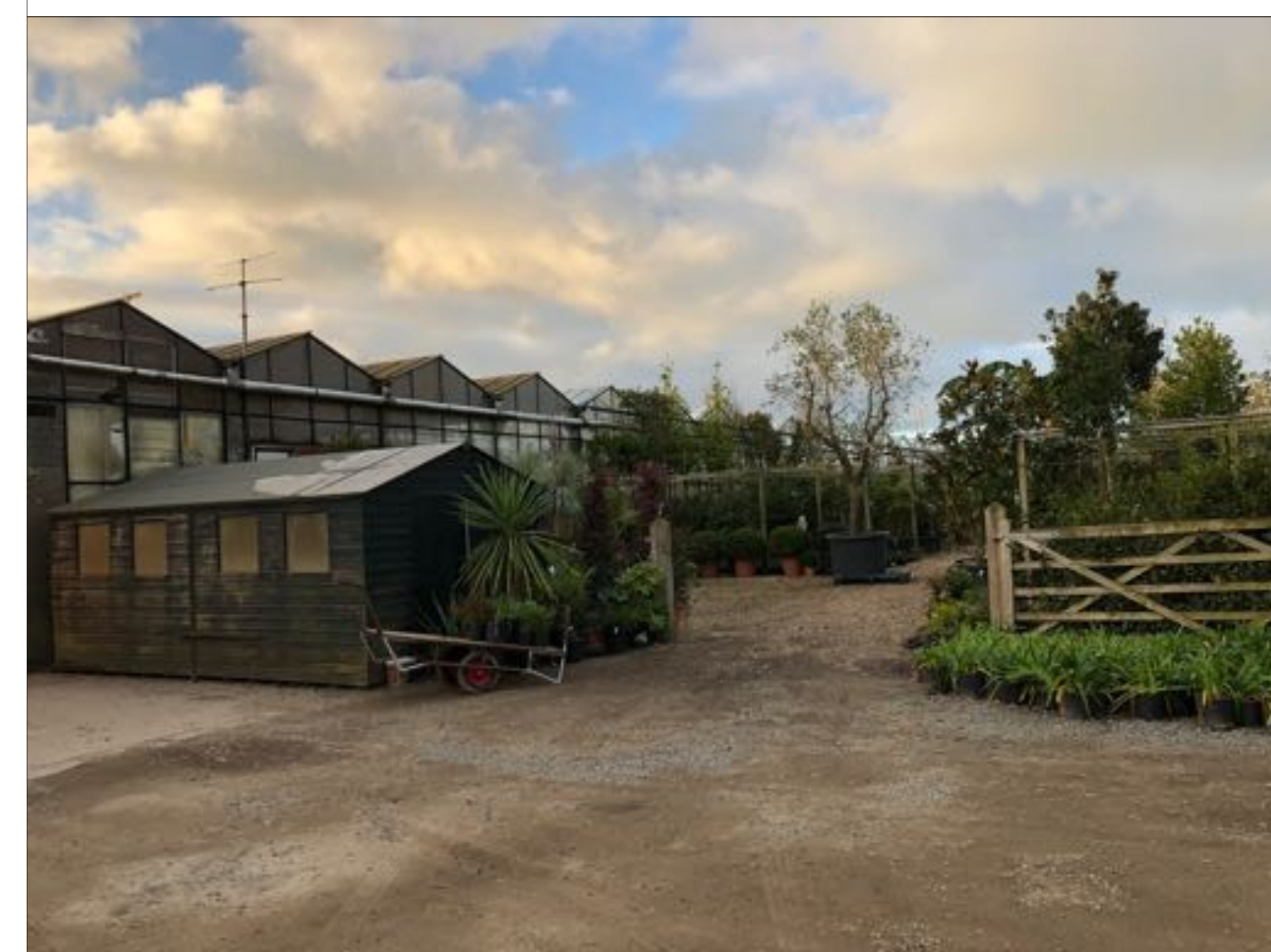
Existing greenhouses (North facade)