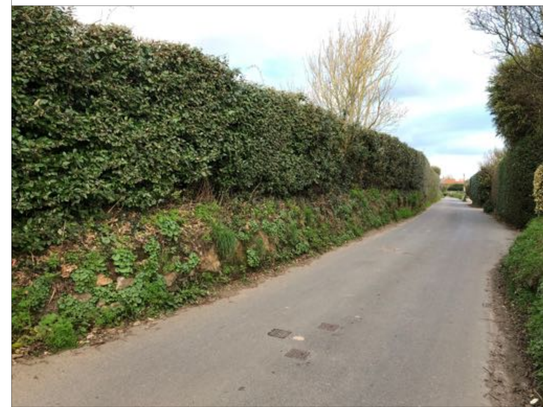
View of existing earthbank and hedgerow from Les Reines looking North