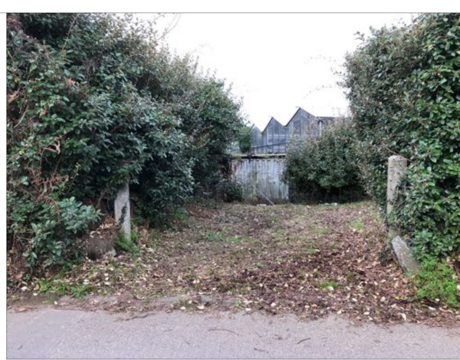
View of existing entrance from Les Reines