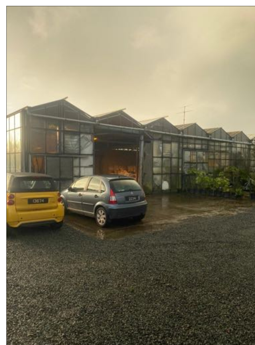
Existing greenhouses (North facade)