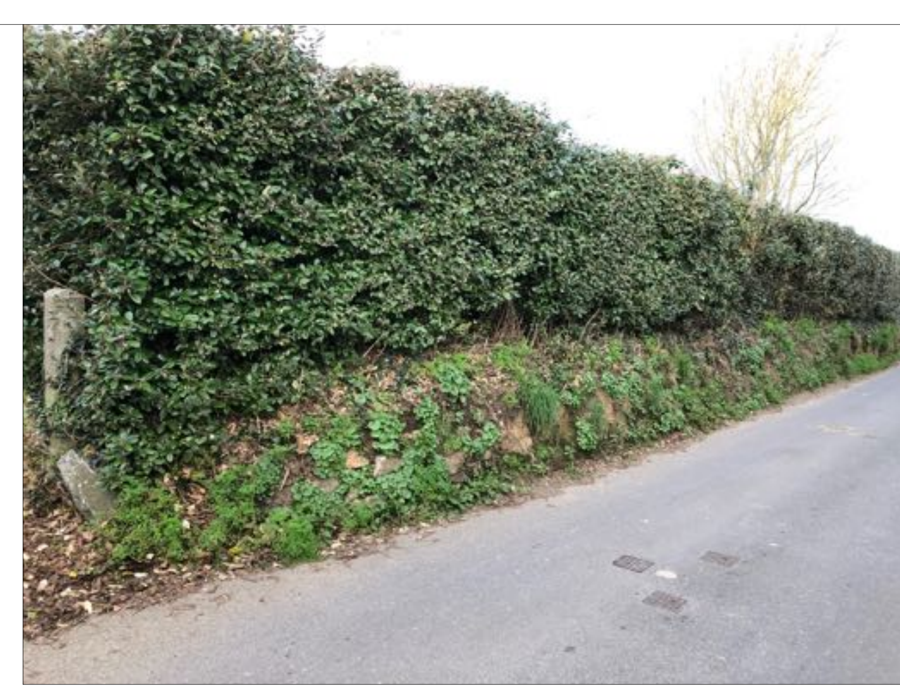
View of existing entrance from Les Reines looking North