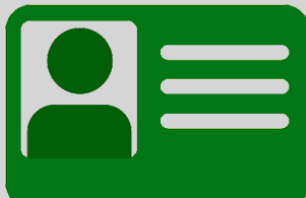
Photo I.D (e.g. Passport, Driving License, Citizen Card)