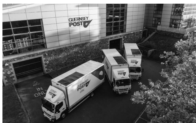
New solar mats on larger fleet vehicles.