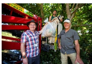
Secondary nest safely removed (30/08/22)