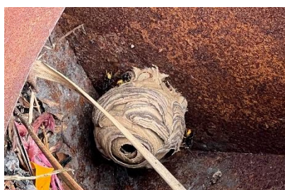
Primary nest inside chiminea (06/06/22)